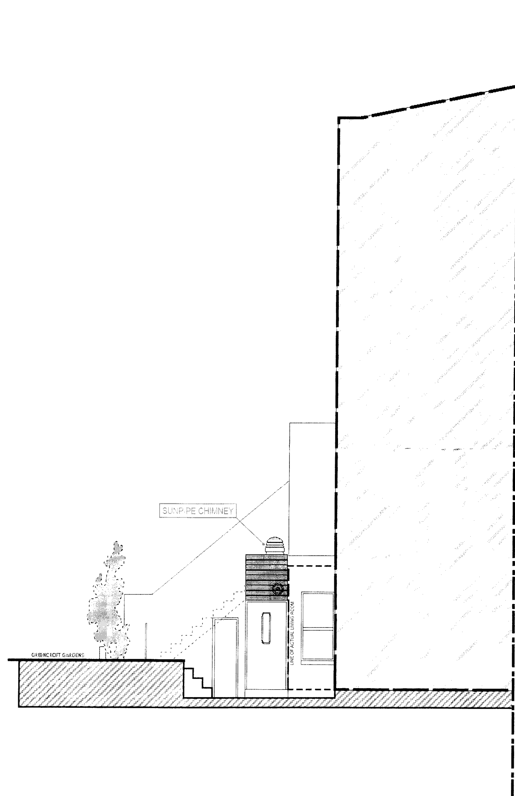
5 PROPOSED ENTRANCE ELEVATION WITH BOXING OF SUNPIPE CHIMNEY scale 1:50