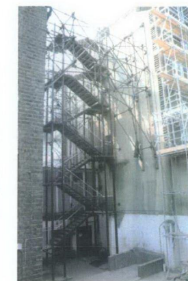
The rear of 73 Guilford St