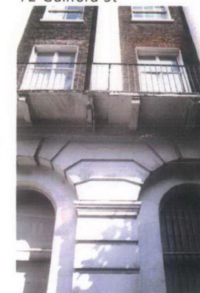
Neighbouring property at 72 Guilford St