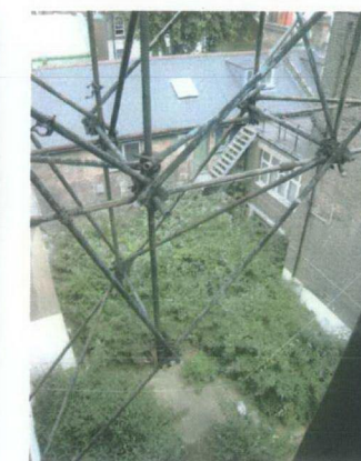
Rear garden at 73 Guilford Street showing raking shores.