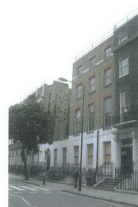
73 & 74 Guilford St