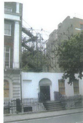
The front of 73 Guilford St