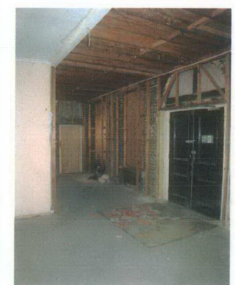
Existing condition of 73 Guilford Street