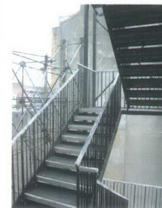
Temporary external stairway at 73 Guilford Street to 72 Guilford Street