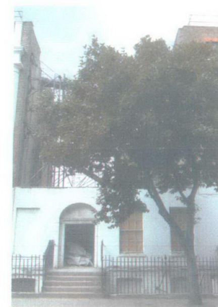
73 Guilford Street