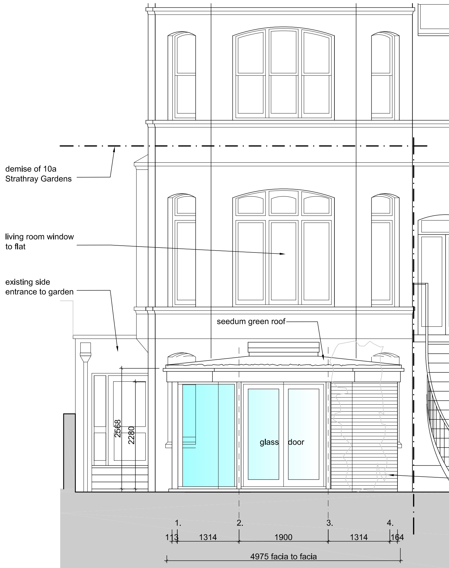
1. Rear (west) Elevation - 1:50