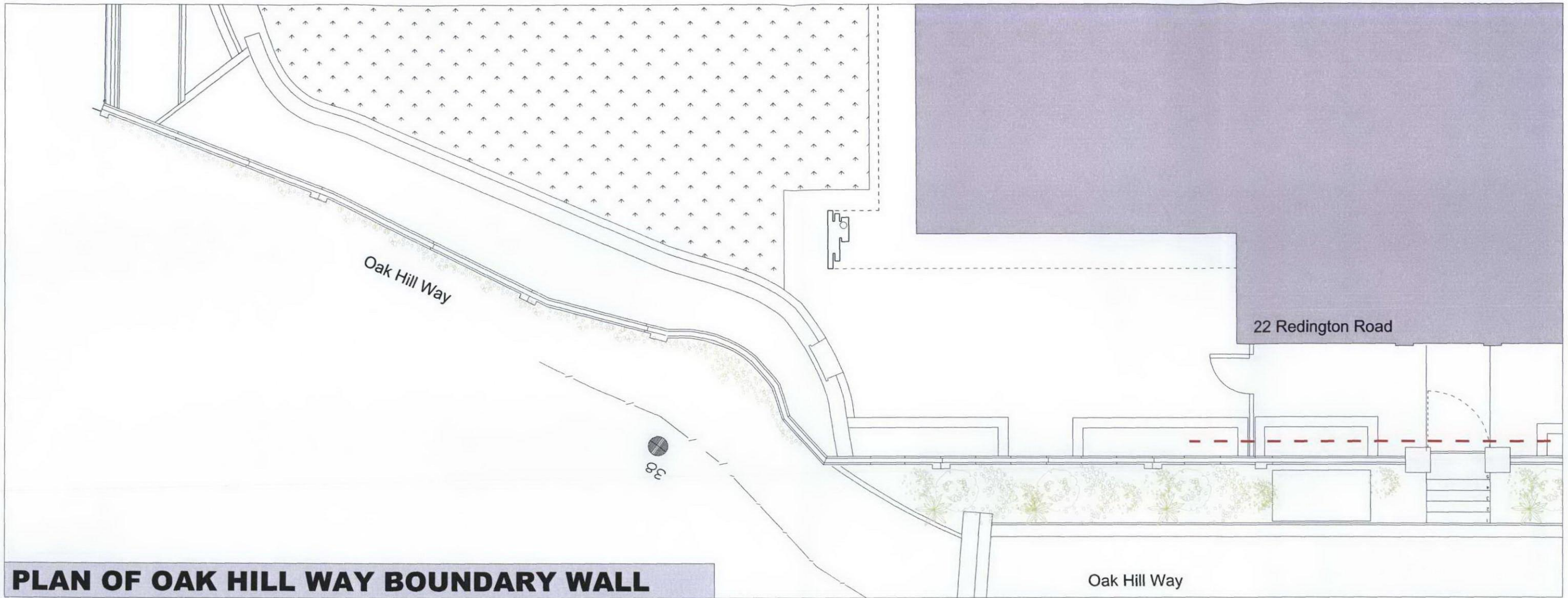
PLAN OF OAK HILL WAY BOUNDARY WALL