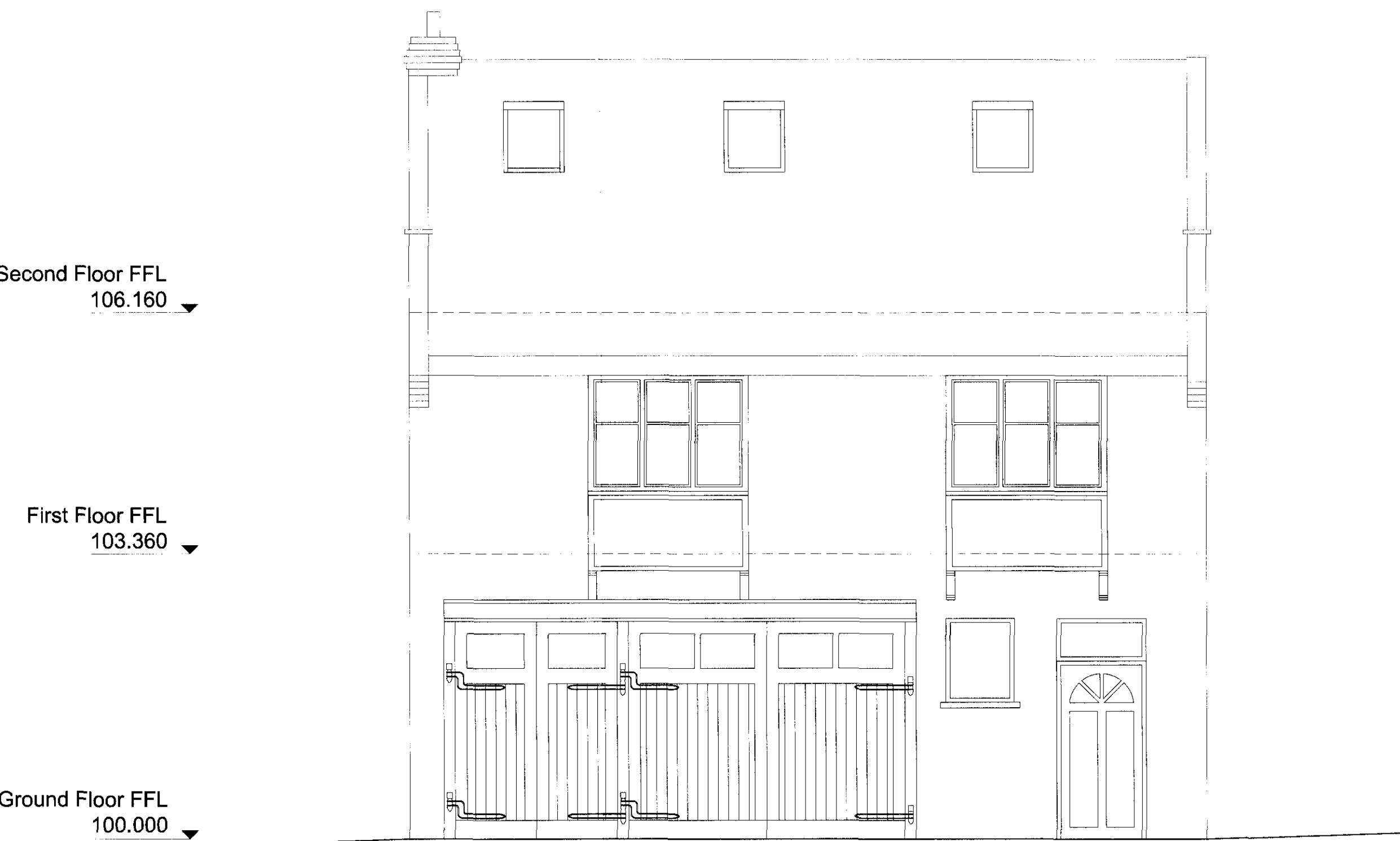
Front Elevation To 18 Deleham Mews