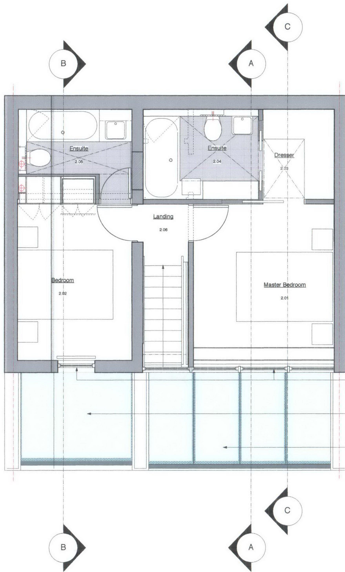
1 Second Floor Plan - Proposed Scale: 1:50 @ A3