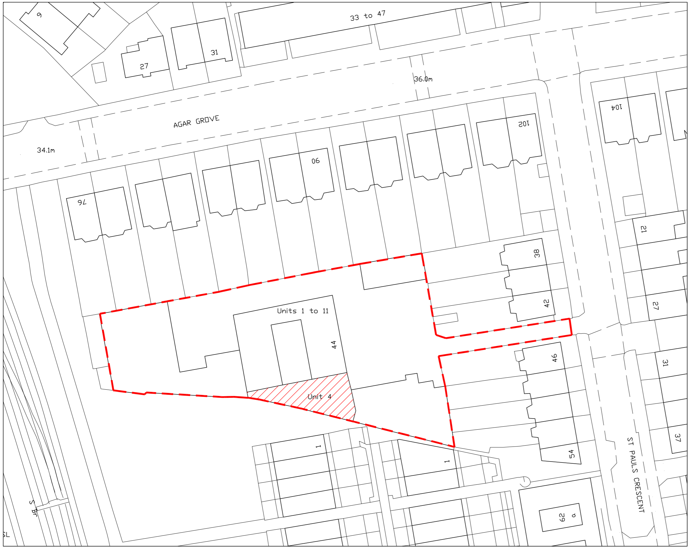
Block Plan Scale:1:500