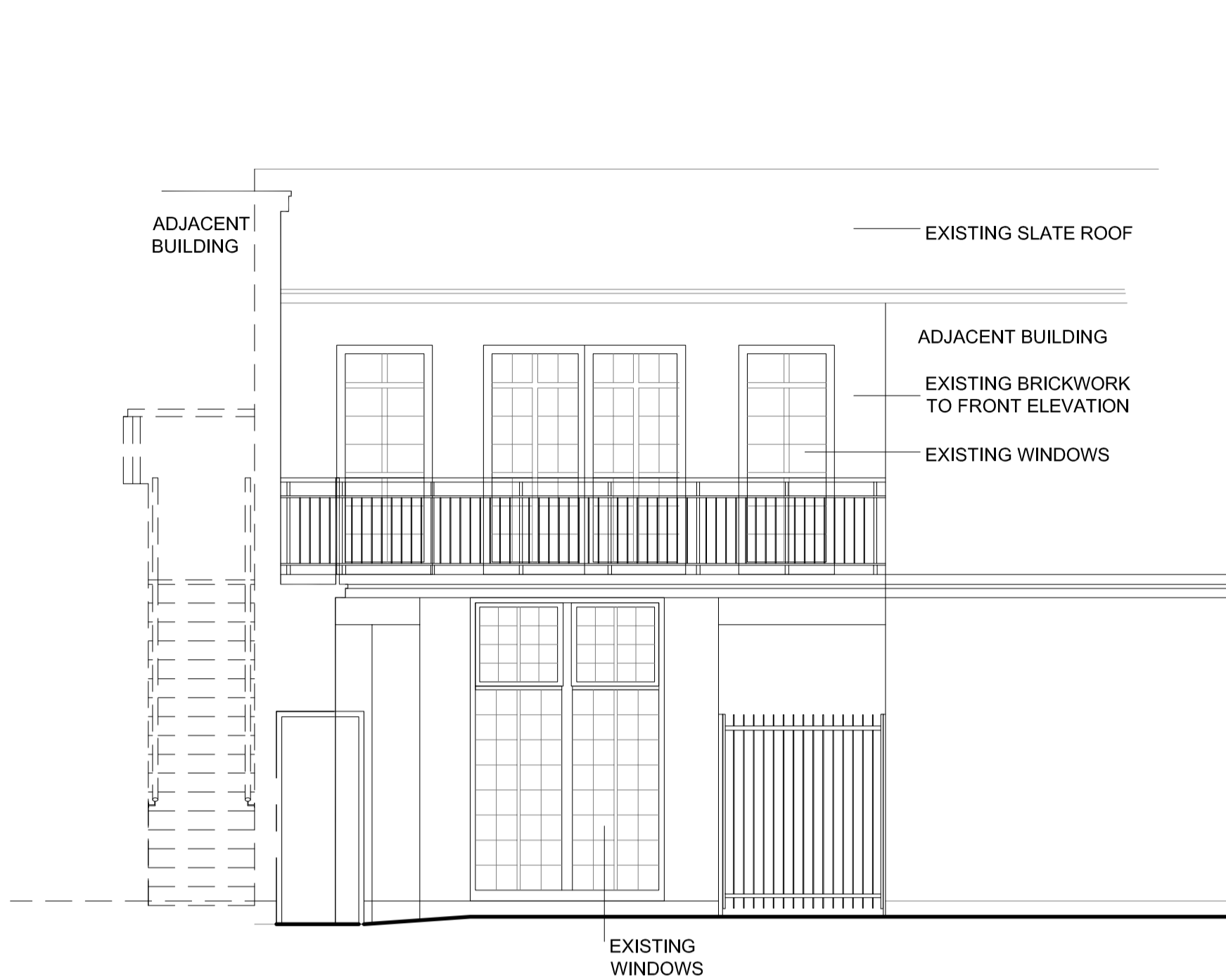
EAST ELEVATION Scale:1:50