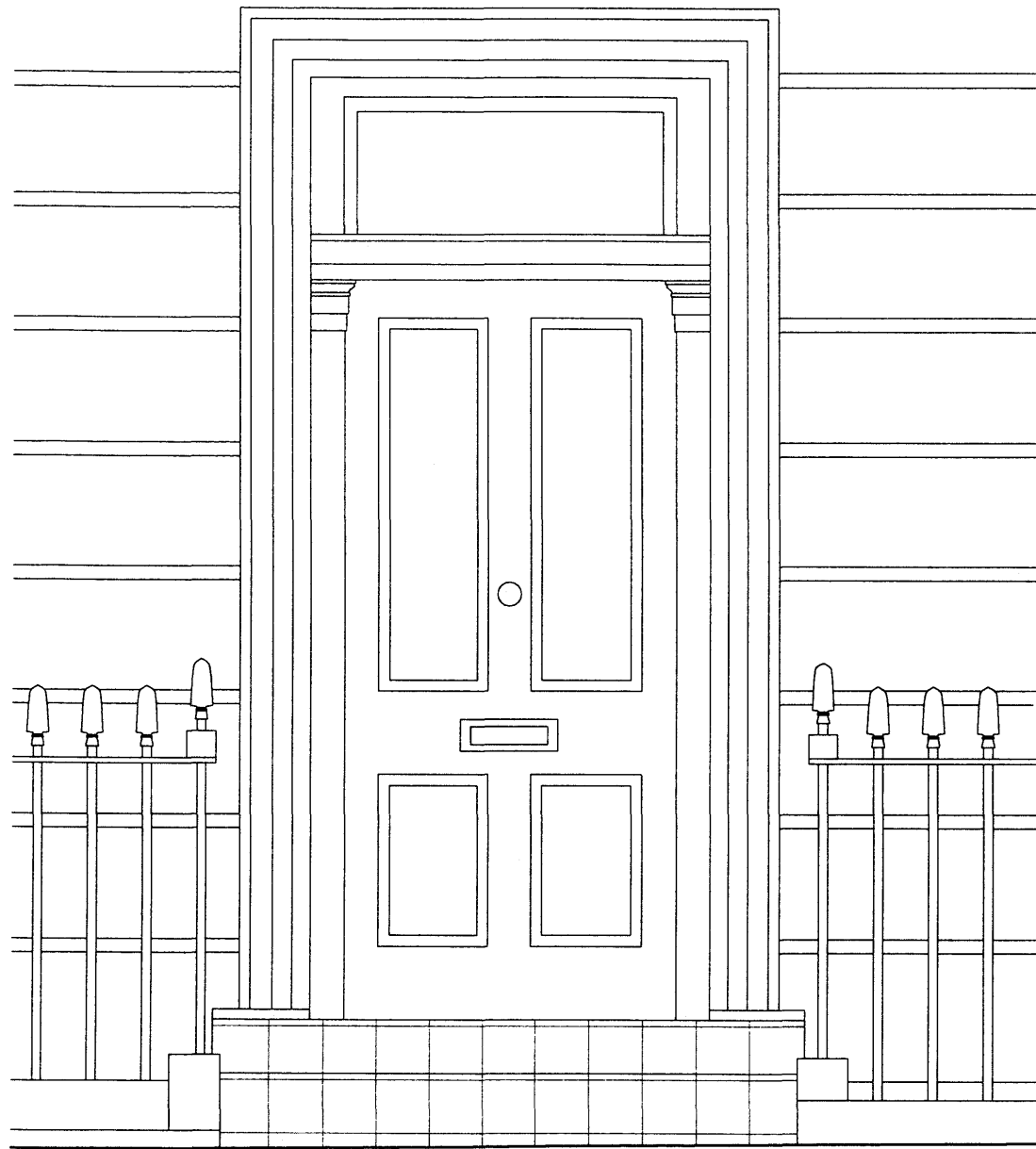
ELEVATION OF FRONT STEPS 1:20 AS EXISTING

Existing quarry tiles to be removed together with any bedding