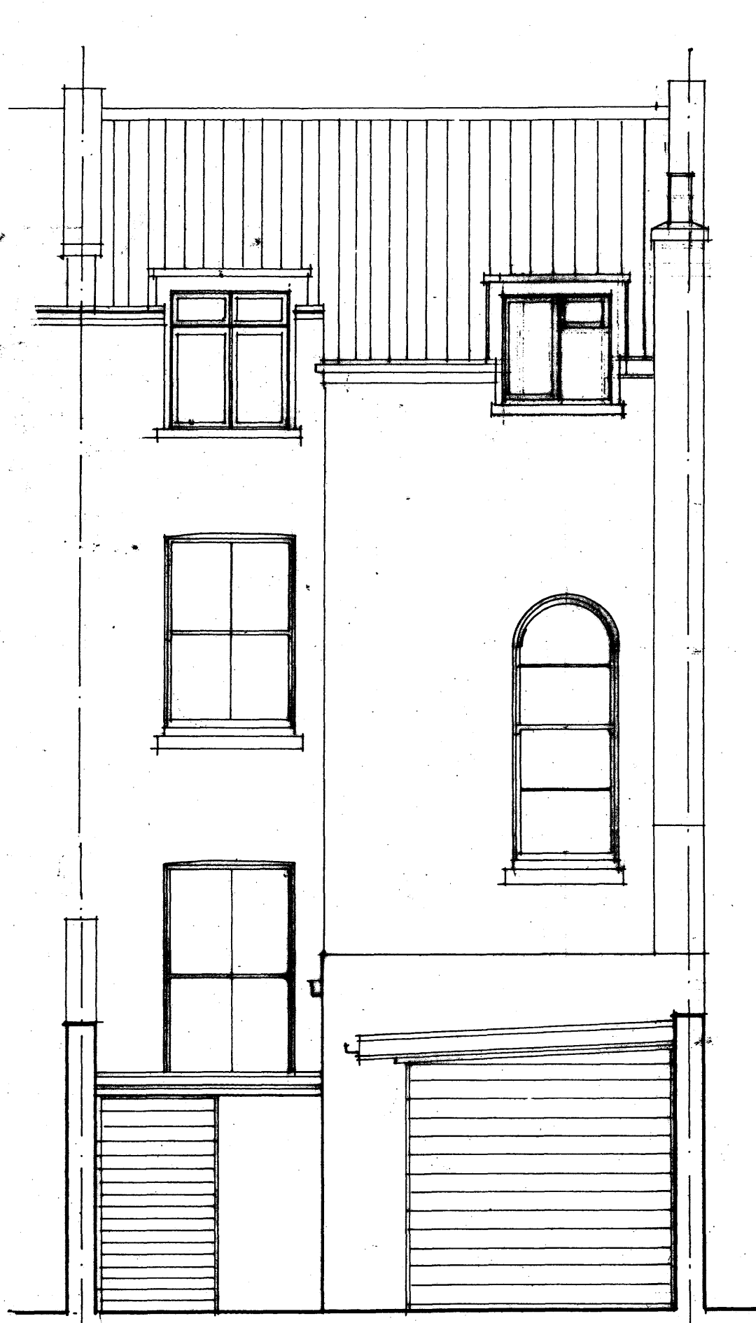
ELEVATION TO GARDEN EXISTING