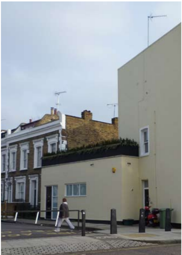
View of 29/31 Hadley Street post development