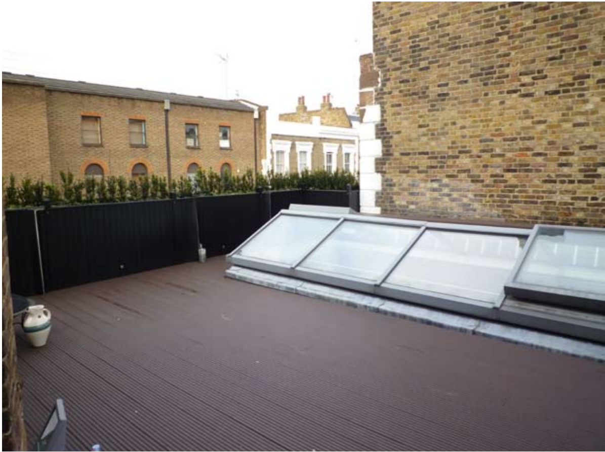
View of roof terrace