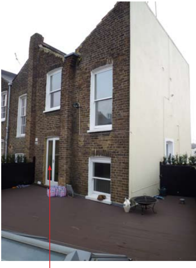
View of new door, within the existing opening