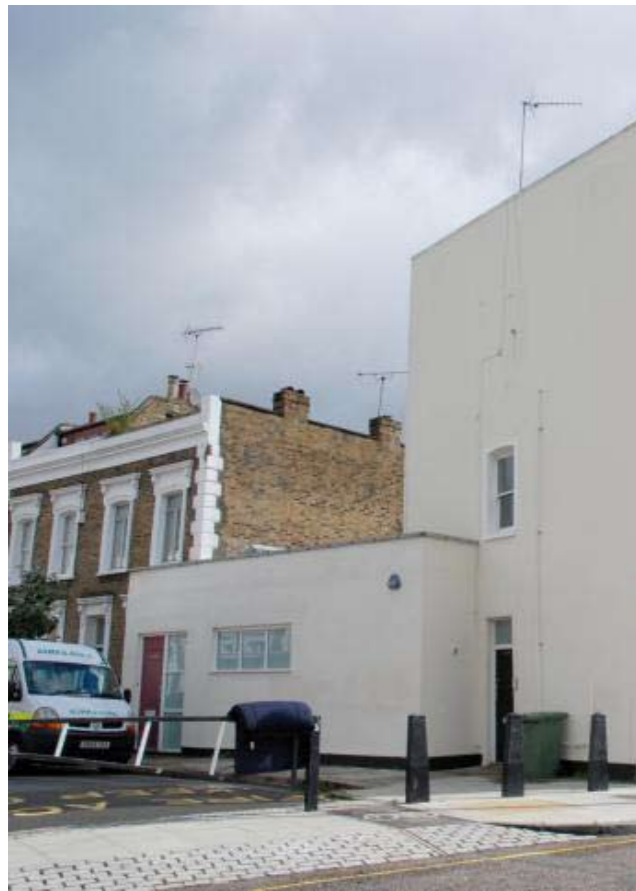
View of 29/31 Hadley Street prior to development