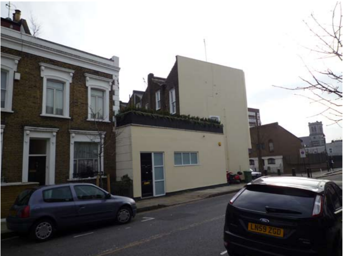
View of 29/31 Hadley Street and corner of Castle Road