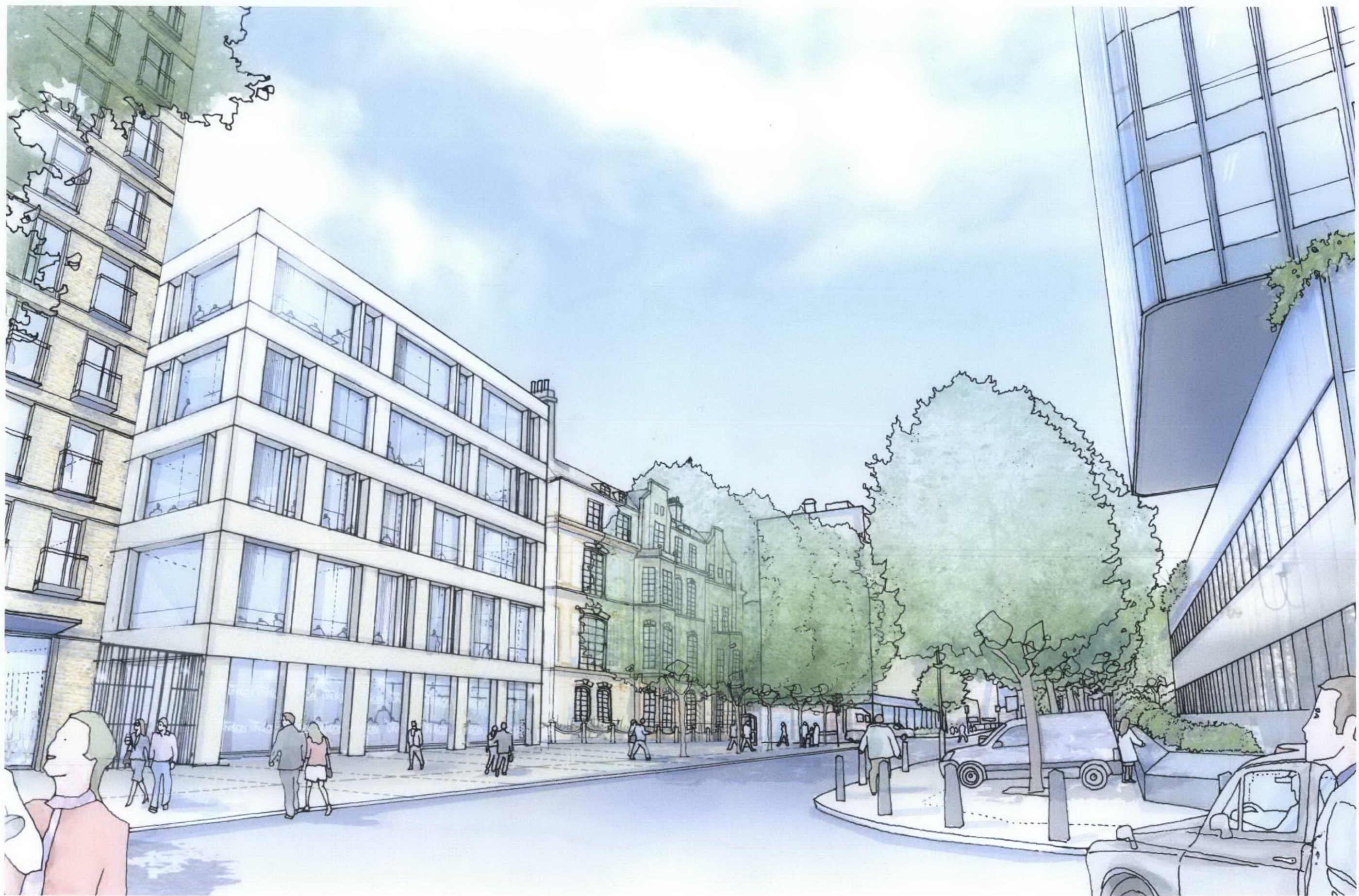
Consented View From Churchway Towards Euston Road