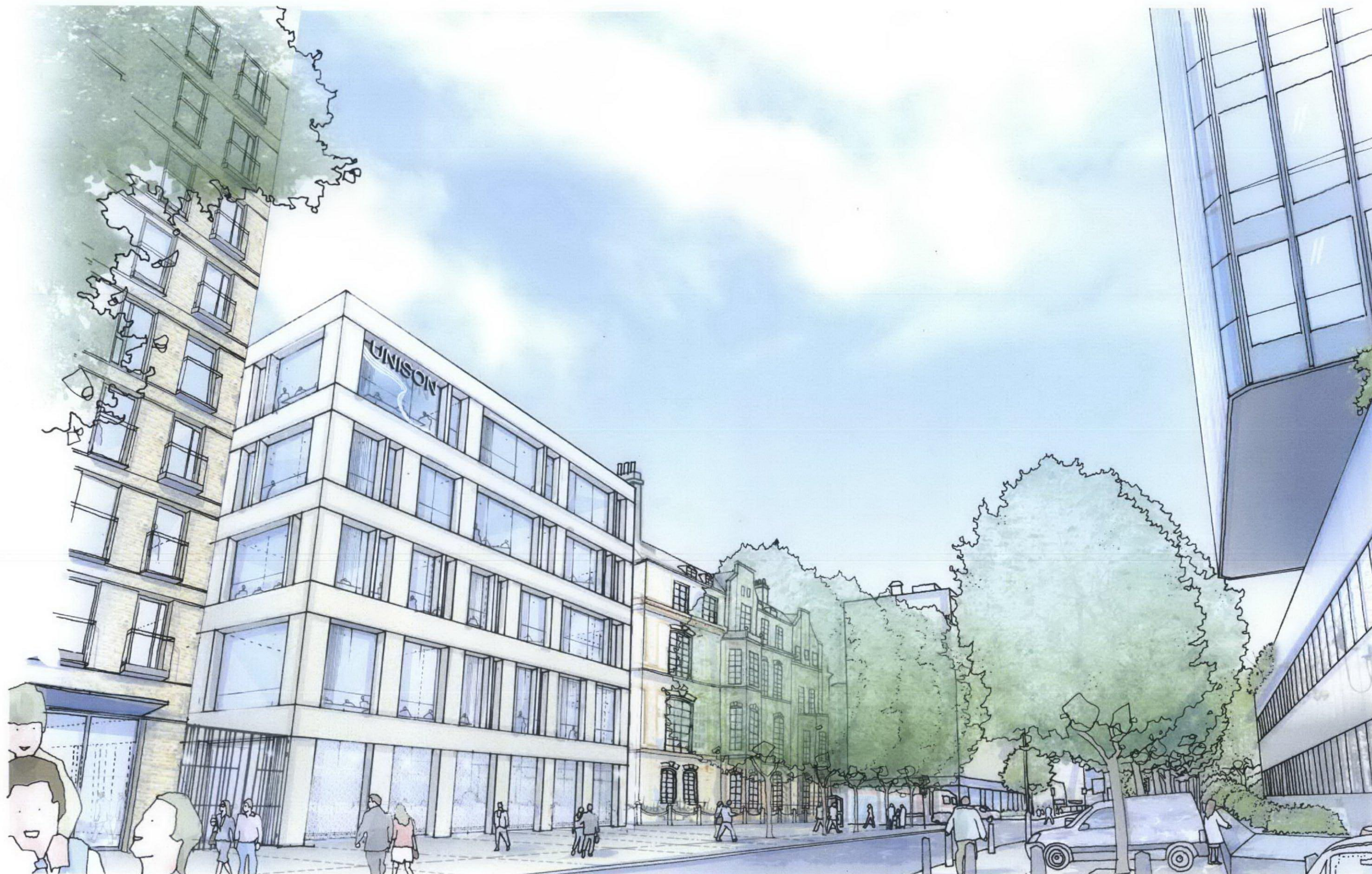
Proposed View From Churchway Towards Euston Road