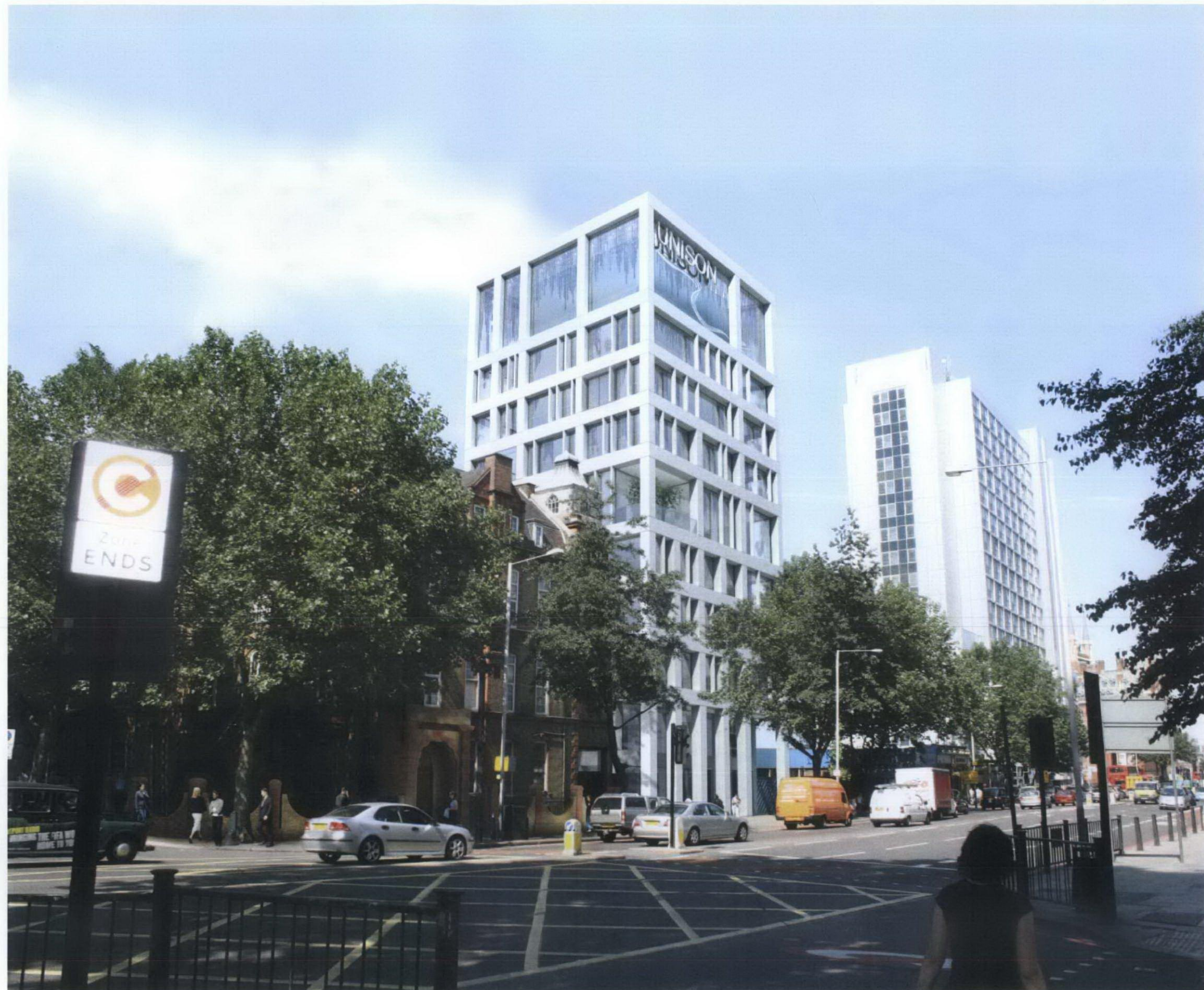
Proposed View East From Euston Road Towards St Pancras