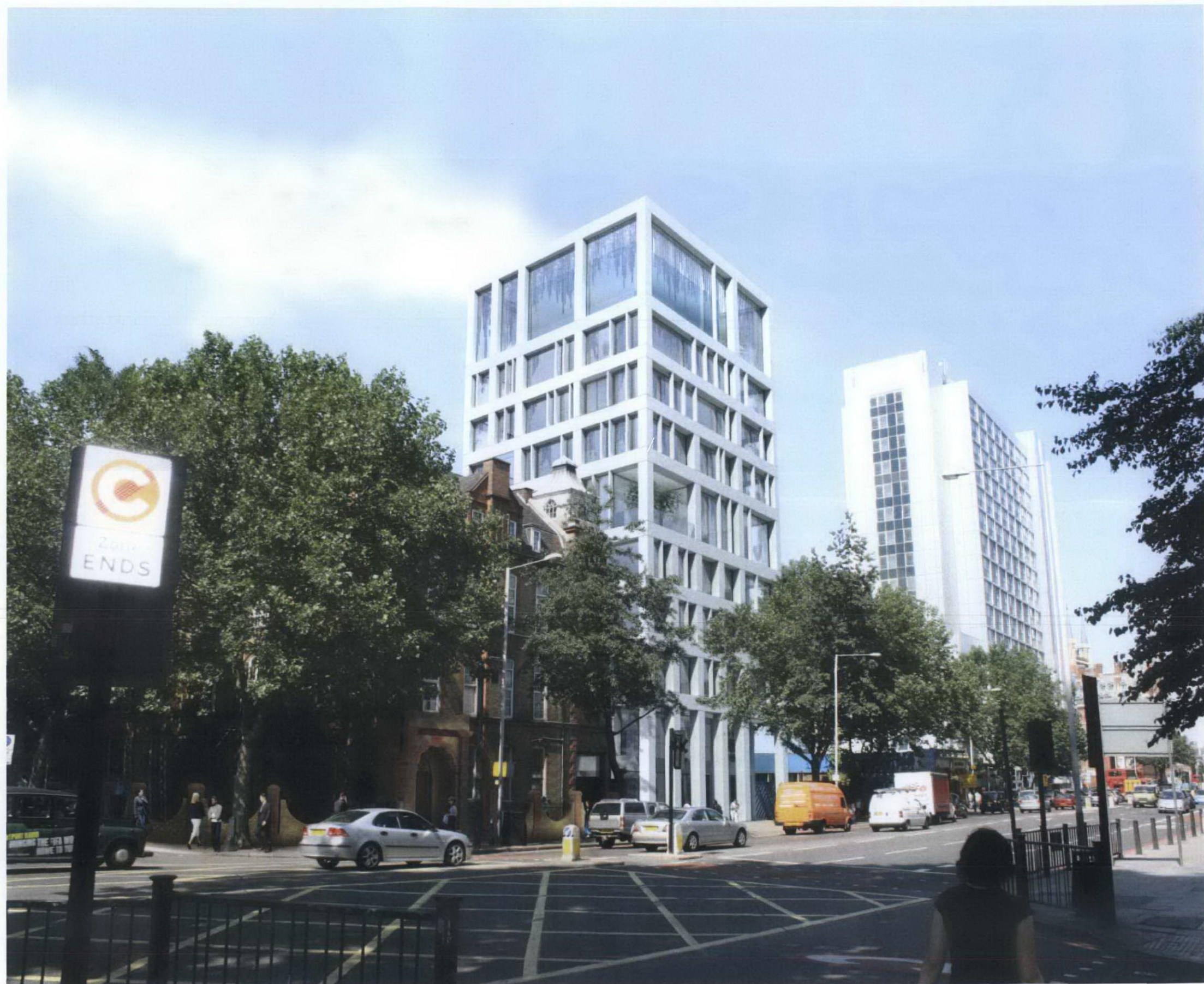
Consented View East From Euston Road Towards St Pancras