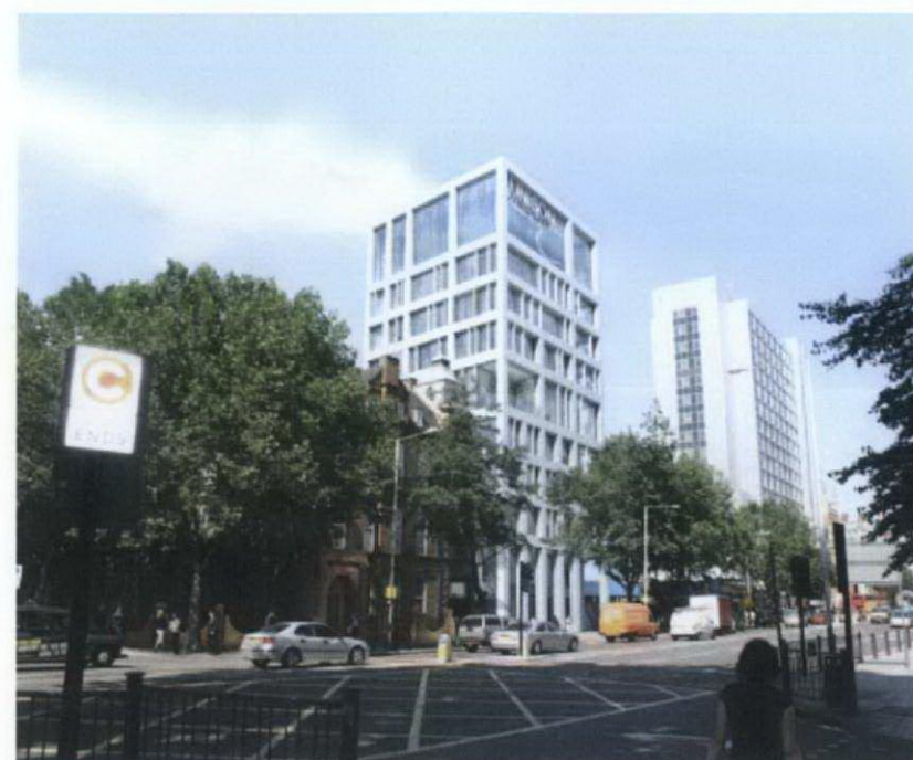
Proposed CGI image from Euston Road Looking East