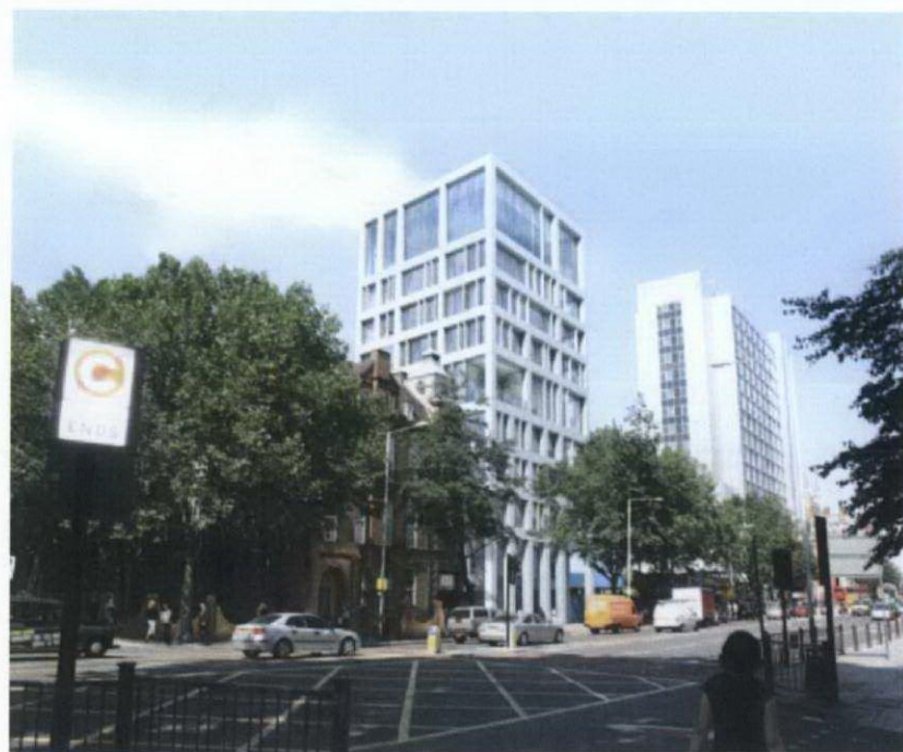
Consented CGI image from Euston Road Looking East