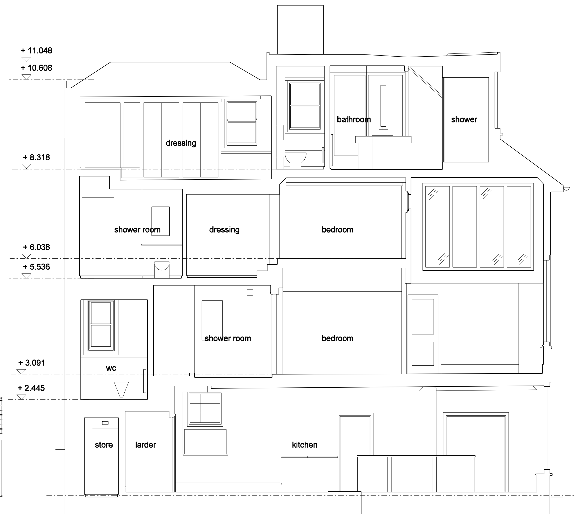
2 Section DD