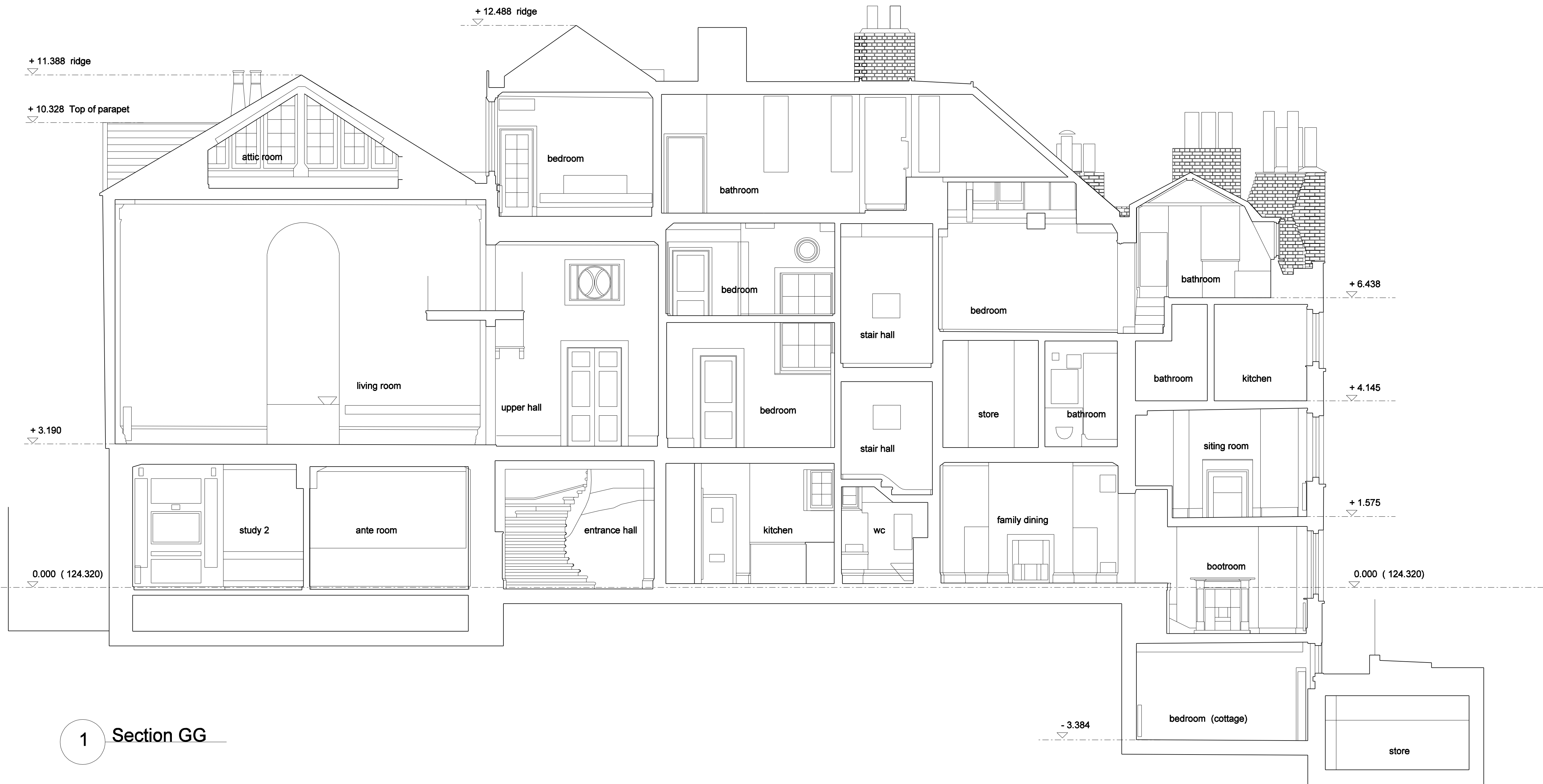
1 Section GG

notes Do not scale drawing All dimensions to be checked on site The ownership of the copyright of this drawing is retained by the architect whose consent must be obtained before any use or reproduction of the drawing or part thereof can be made. This drawing should be read in conjunction with all other relevant documentation