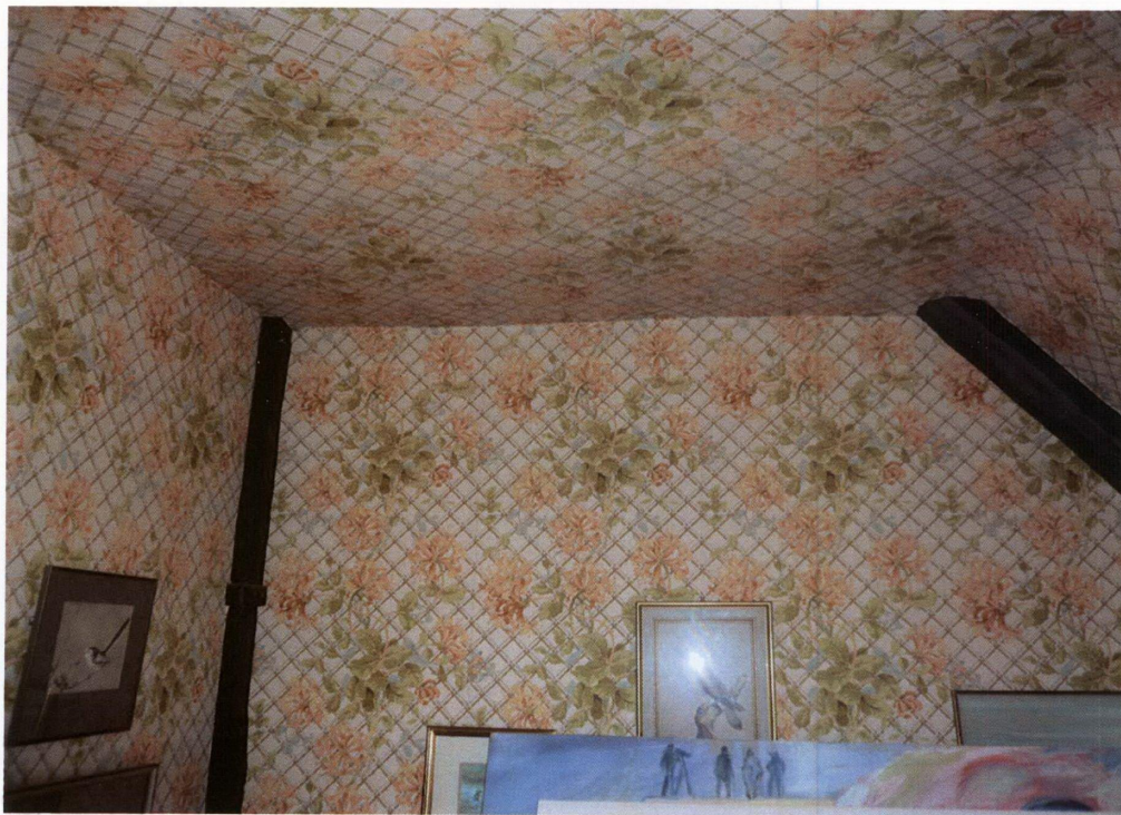
Second floor bedroom in vicinity of proposed wheelchair lift