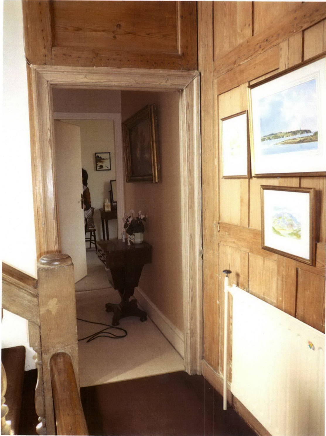
First floor stair landing and lobby