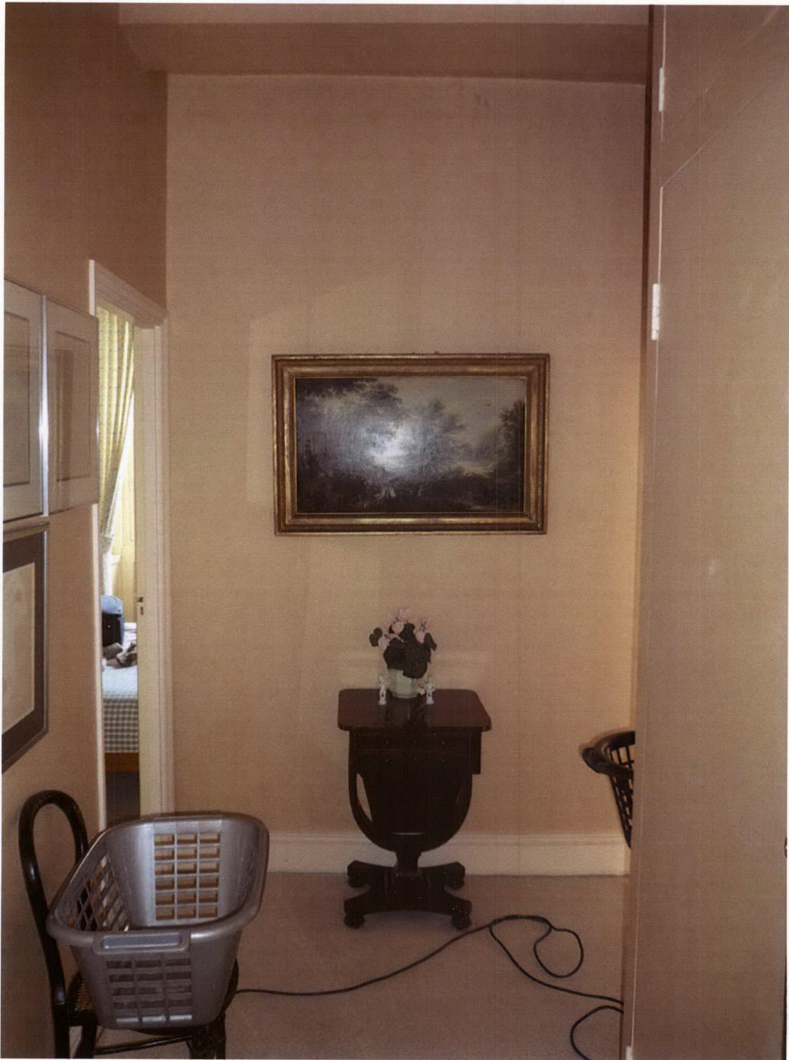
First floor lobby in location of proposed wheelchair lift