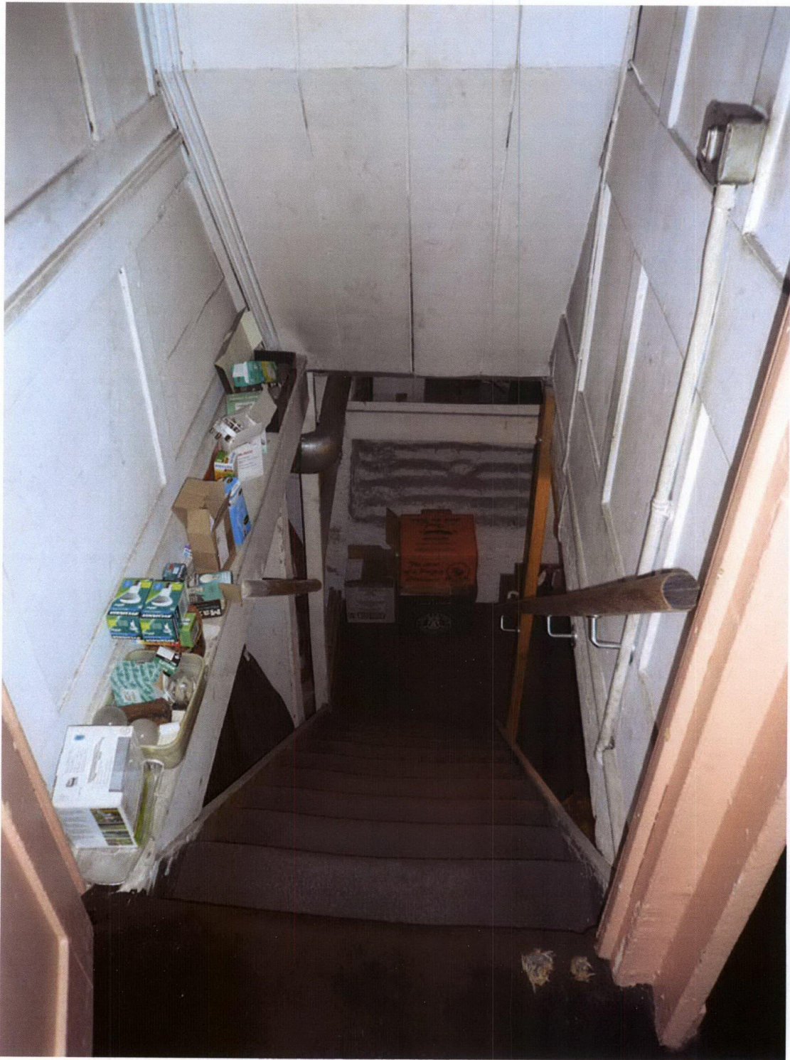
View of stairs down to basement from ground floor