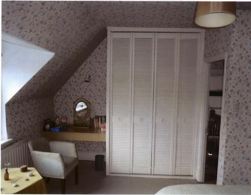
Second floor bedroom in vicinity of proposed wheelchair lift