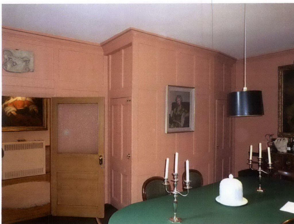
View of staircase enclosure dining room ground floor