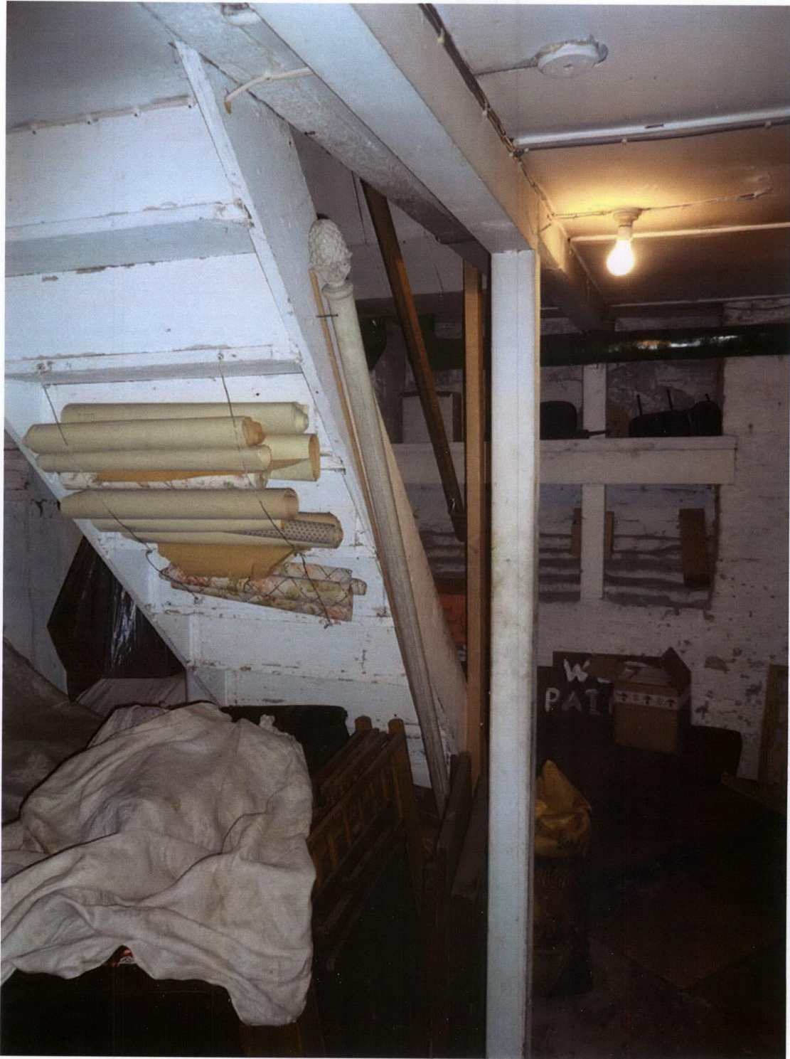
View of underside of existing stairs at basement level