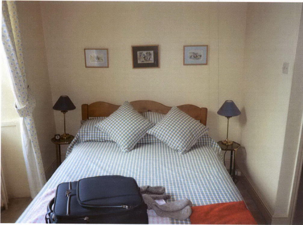
First floor bedroom : wall in location of proposed wheelchair lift