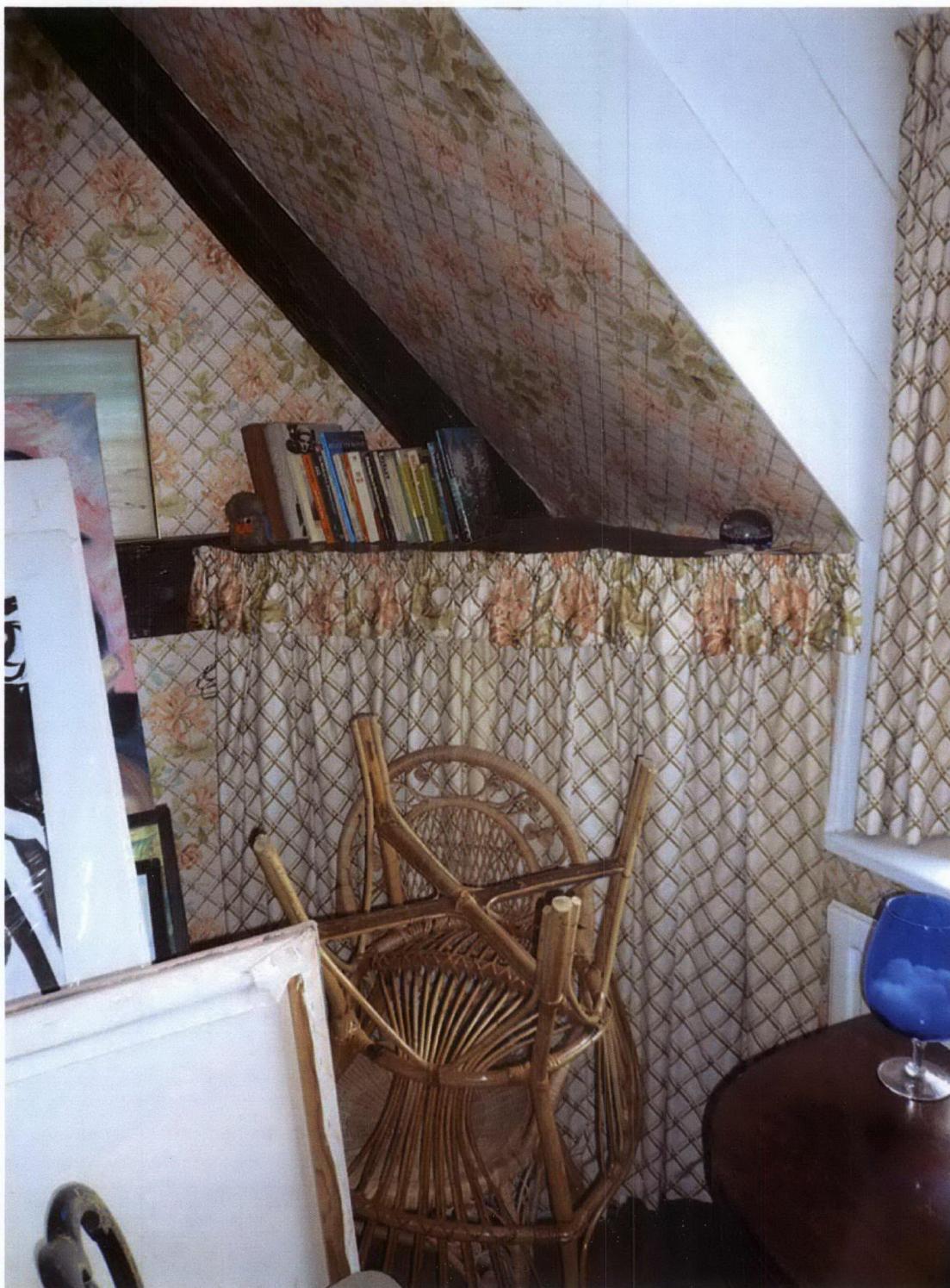
Second floor bedroom in vicinity of proposed wheelchair lift