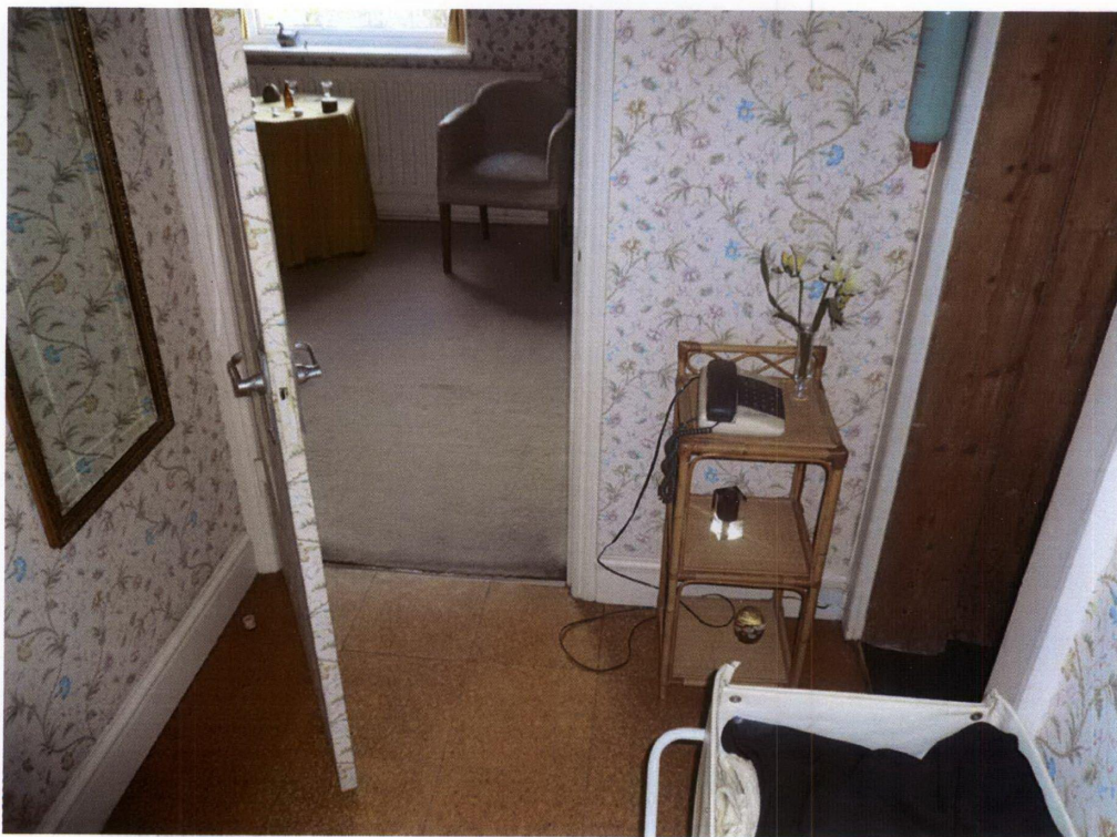
Second floor lobby in vicinity of proposed wheelchair lift