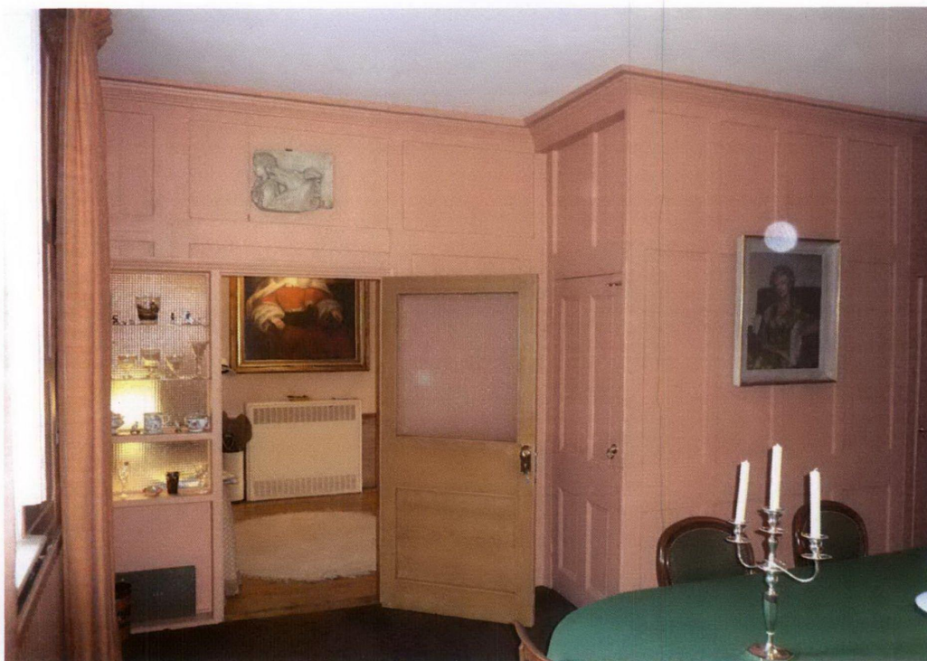
View of staircase enclosure dining room ground floor

Voel House, 18 South Grove, Highgate, London N6