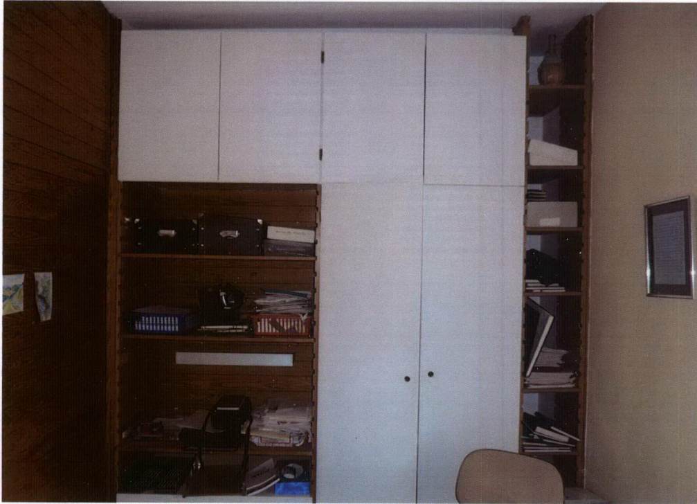
First floor built in cupboards in location of proposed wheelchair lift