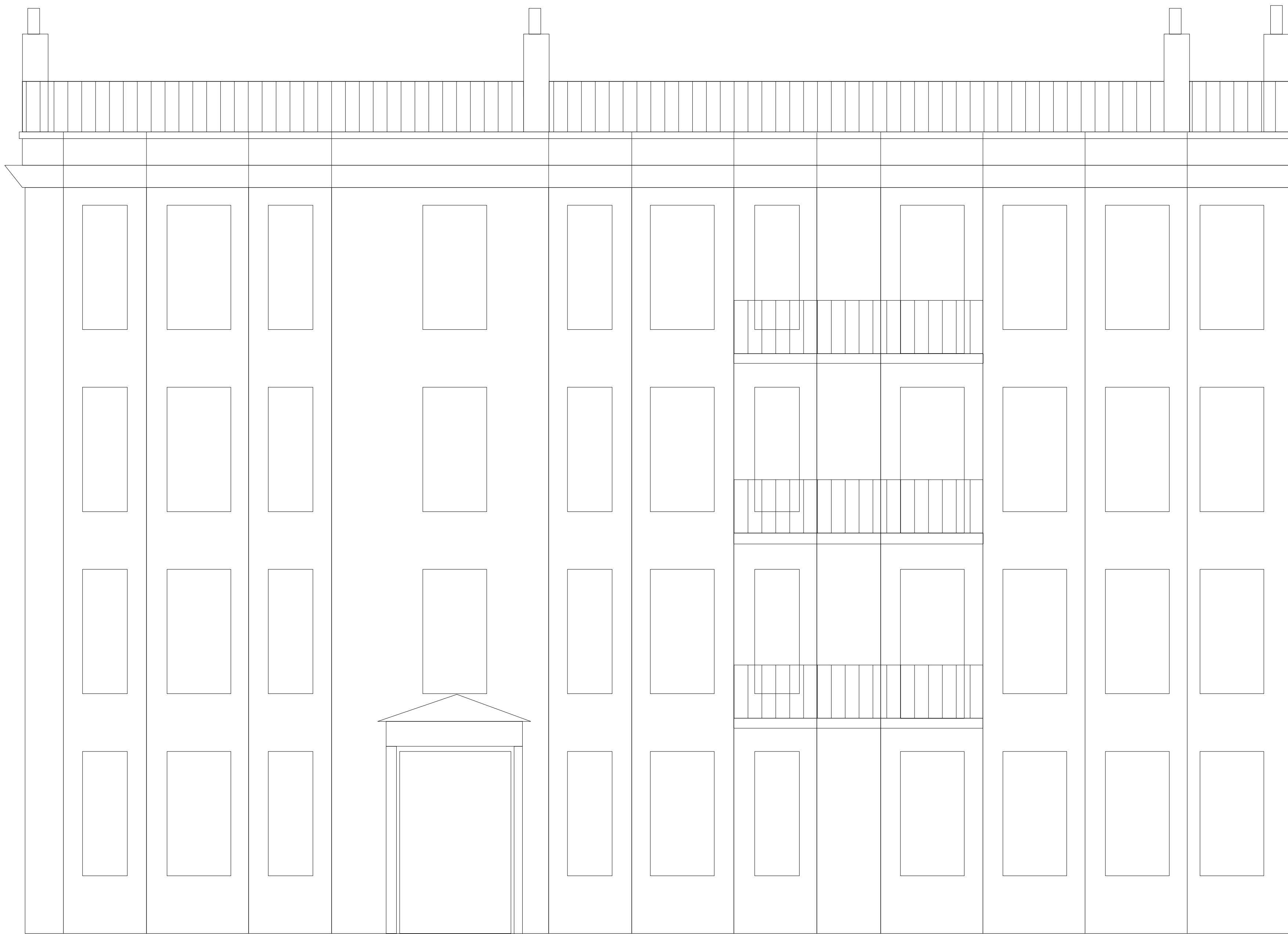
THE MOUNT ELEVATION

PROPOSED METAL RAILINGS 100 mm CENTRES BETWEEN VERTICAL UPRIGHTS. NEW RAILINGS FIXED TO INTERNAL FACE OF PARAPETS. TOTAL HEIGHT OF RAILINGS AND INTERNAL FACE OF PARAPET WALLS: 1100 mm