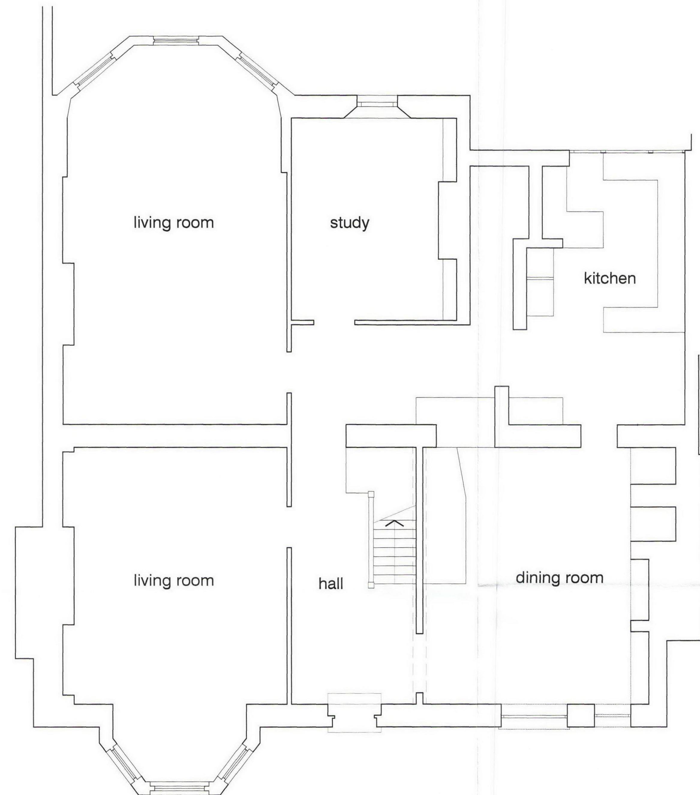
Existing ground floor plan