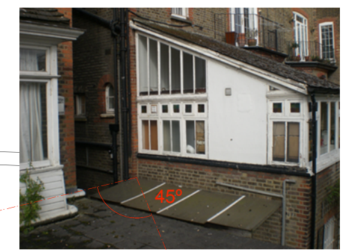
PHOTO SHOWING SIDE OF No. 46 AND LOCATION OF 45° ANGLE MARKED ON PLAN