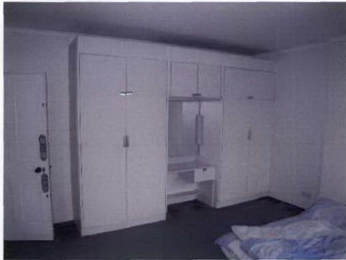
Image 2: Non original wardrobe to be removed. Existing door to be retained & upgraded.