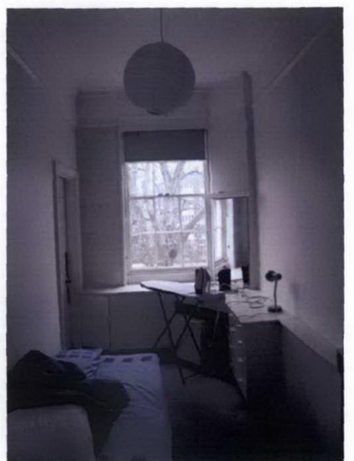
Image 5: Non original fittings / furniture to be removed new skirting and cornice to match original where required