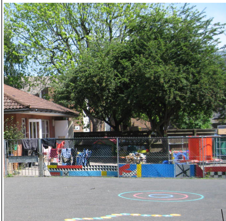
Hawthorn Tree approx 6m tall, trunk girth of approx 150mm To be removed

Do not scale off this drawing. All dimensions to be checked on site