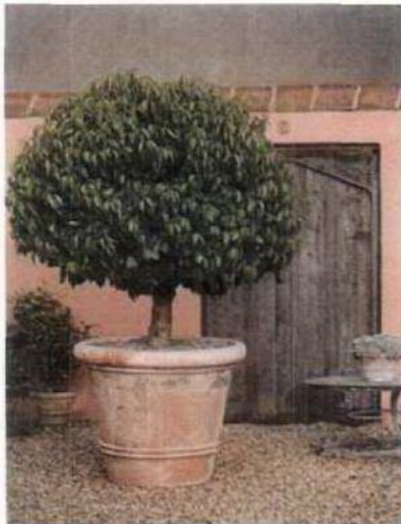
Large clay terracotta pots compliment the style of the building and the other surface materials used in the garden design.