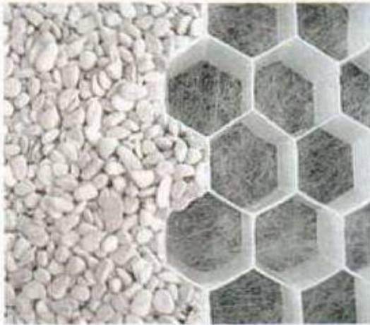
Nidagravel - a honeycombe system that allows a permeable drive surface.