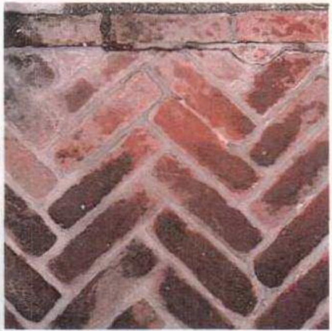
Reclaimed bricks to reflect the mature nature of the garden at present.