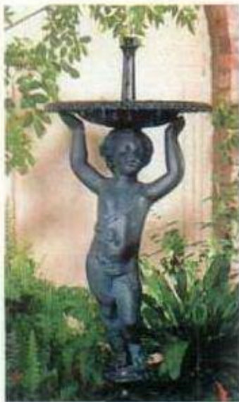
The existing fountain cherub will be used and reinstated within the new design of the garden.