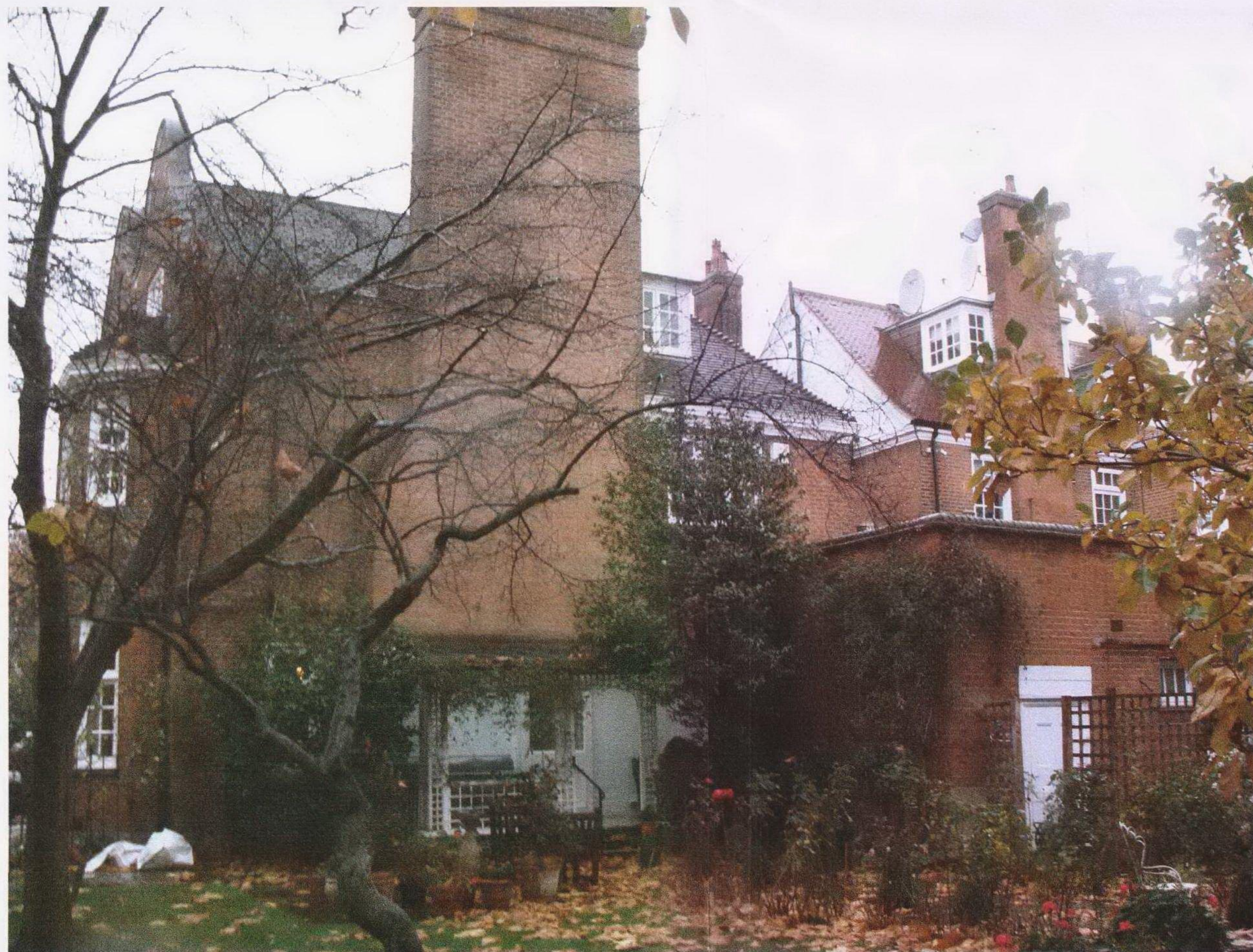
3 NTS ELEVATION N2