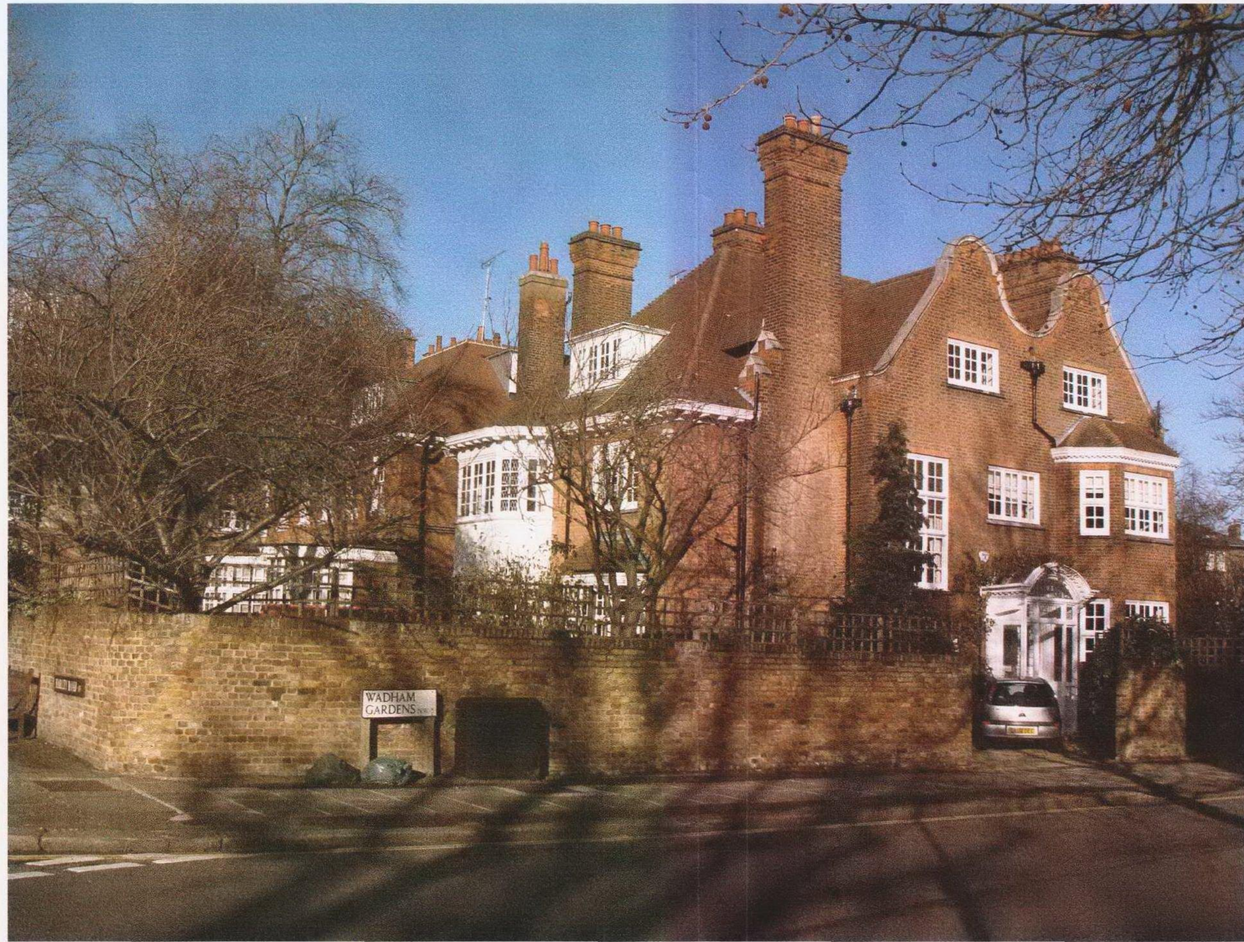
1 NTS ELEVATION N1