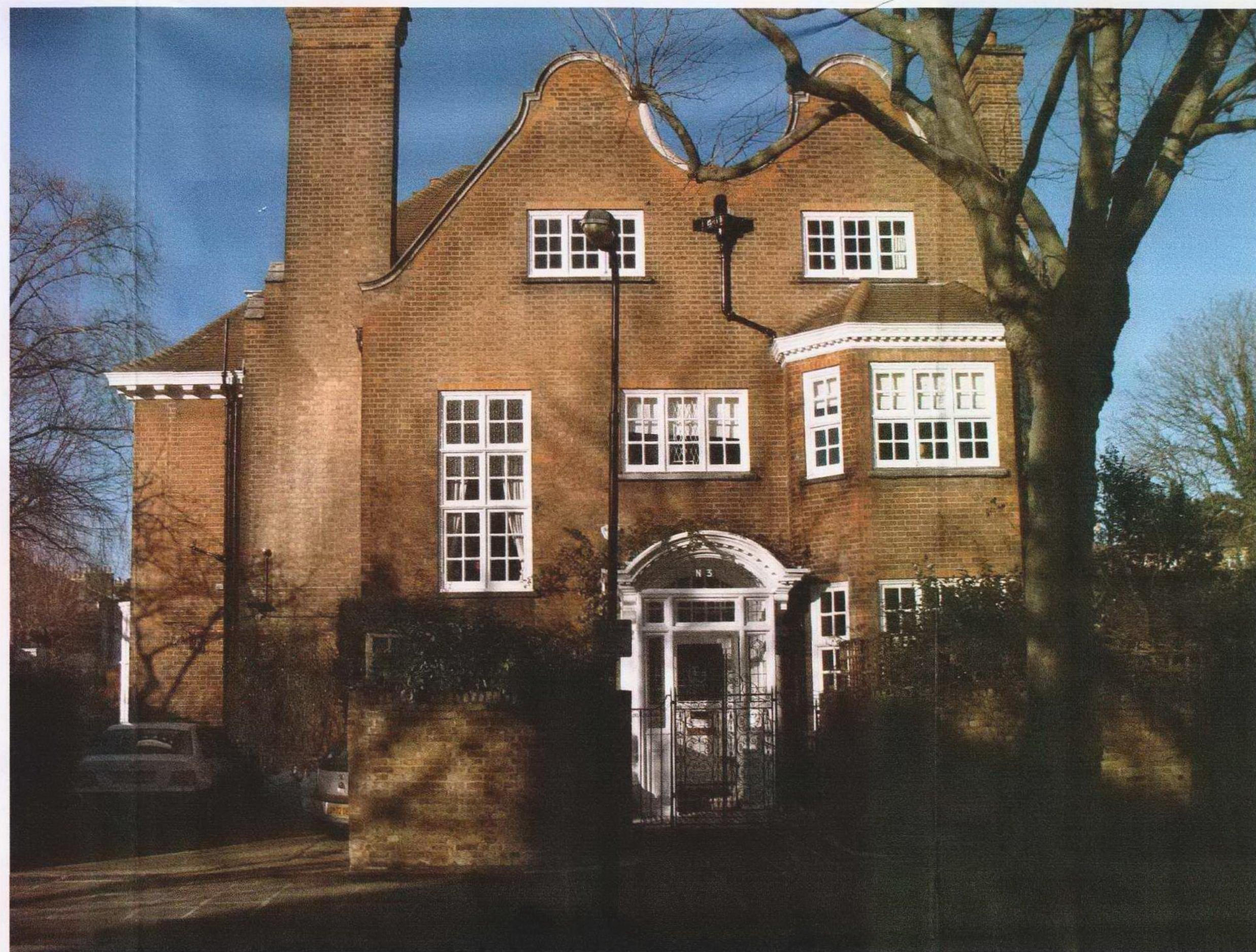
4 NTS ELEVATION N2

Figured dimensions only are to be taken from this drawing. All dimensions are to be checked on site before any work is put in hand. If in doubt, ask.