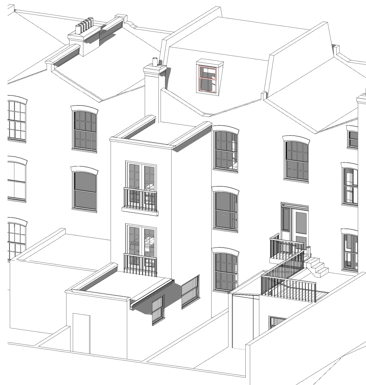
Proposed Rear Terrace Perspective