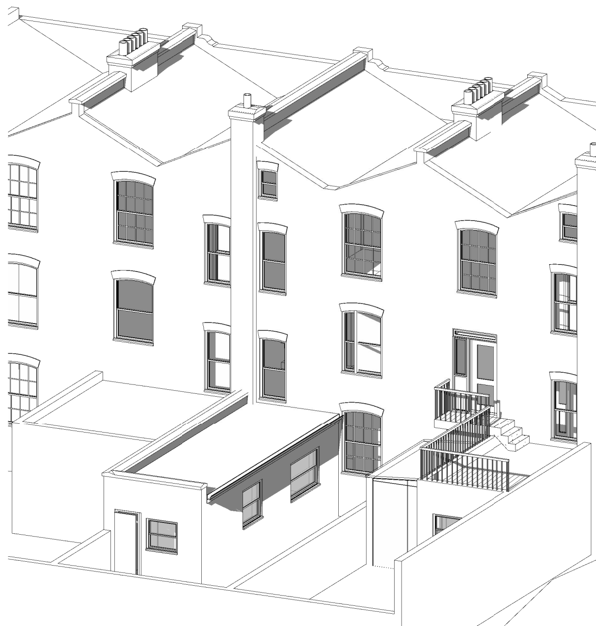
Existing Rear Terrace Perspective