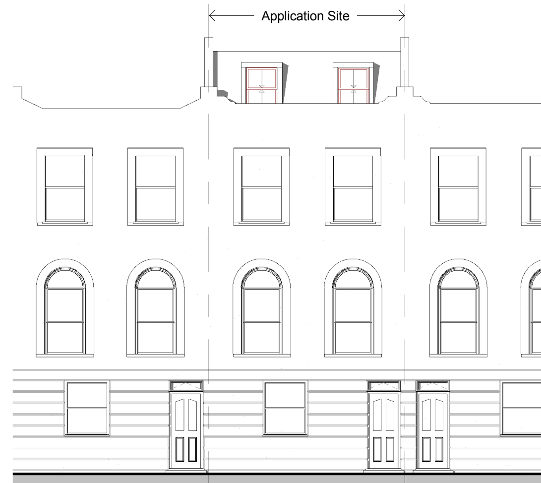
Part Terrace - Proposed Elevation