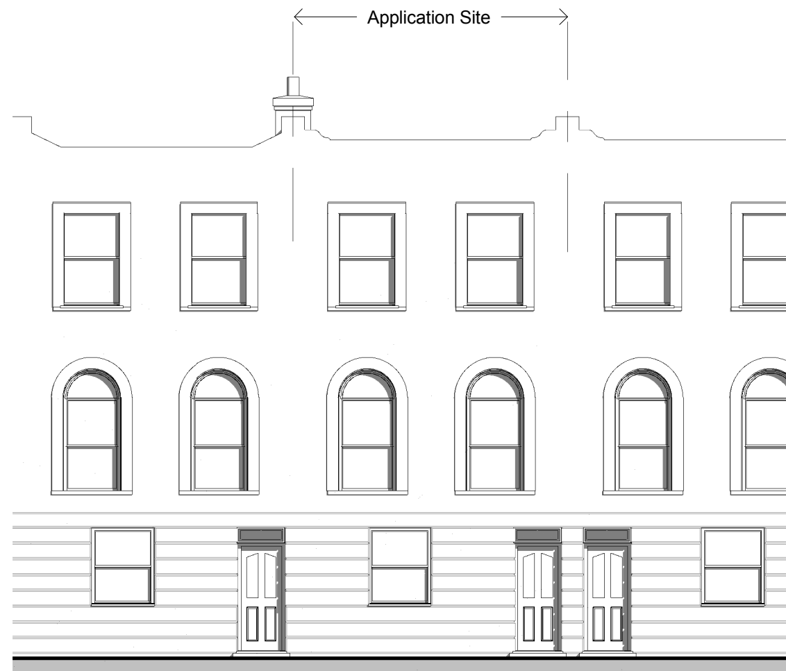
Part Terrace - Existing Elevation