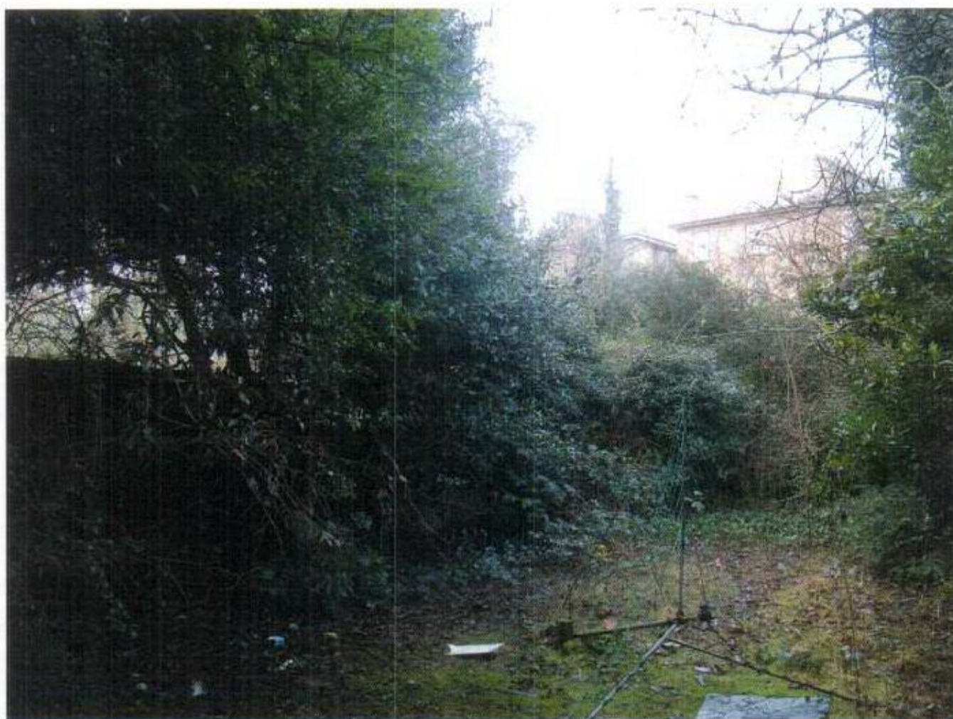
Photograph 7 – View down the left hand side of the garden showing Trees 4 & 5 to the left and centre. Tree 2 can just be seen in the top right.