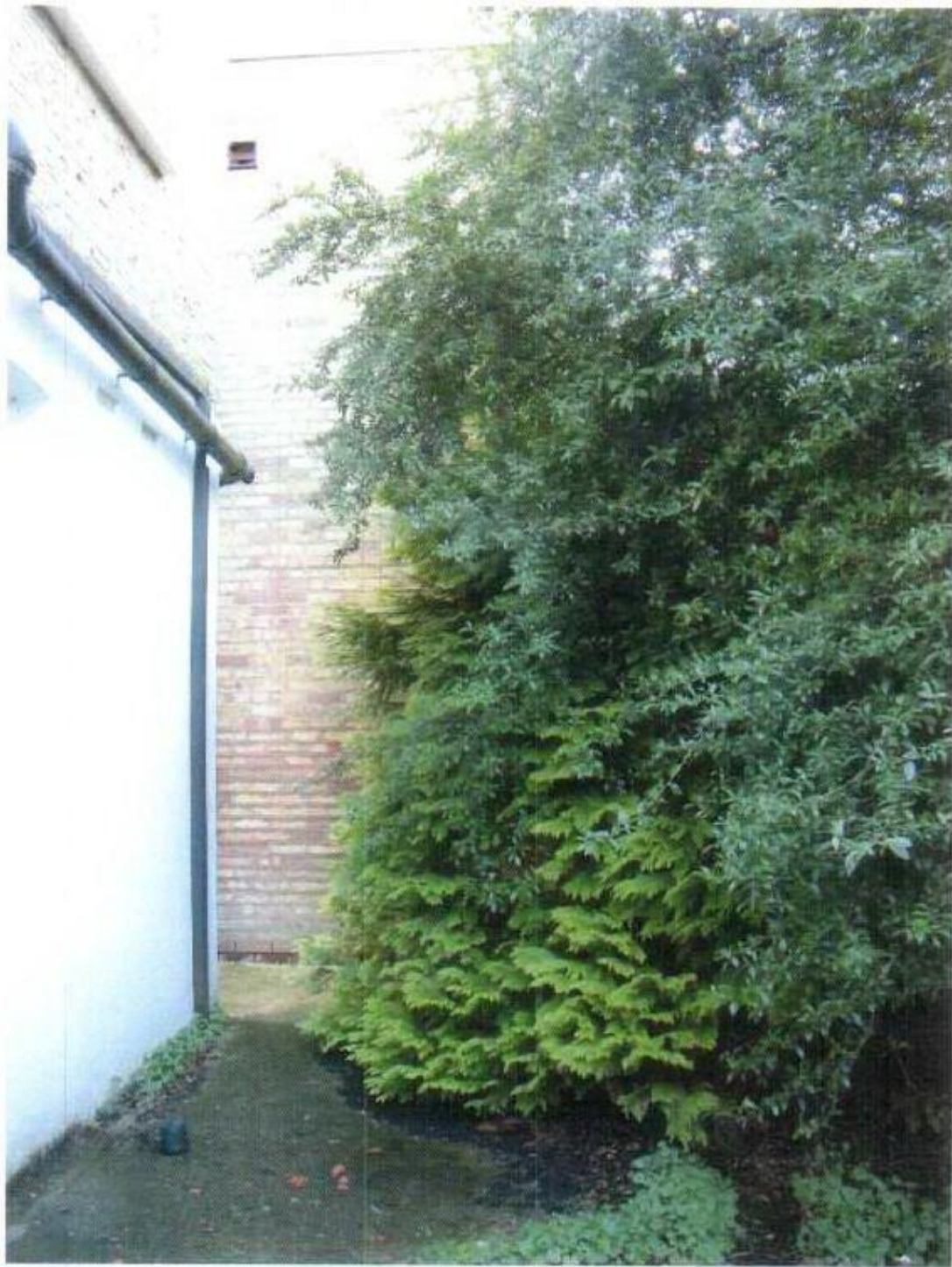
Photograph 3 - View of Tree 5 [and 2 stunted conifers] rear elevation of property is on the left