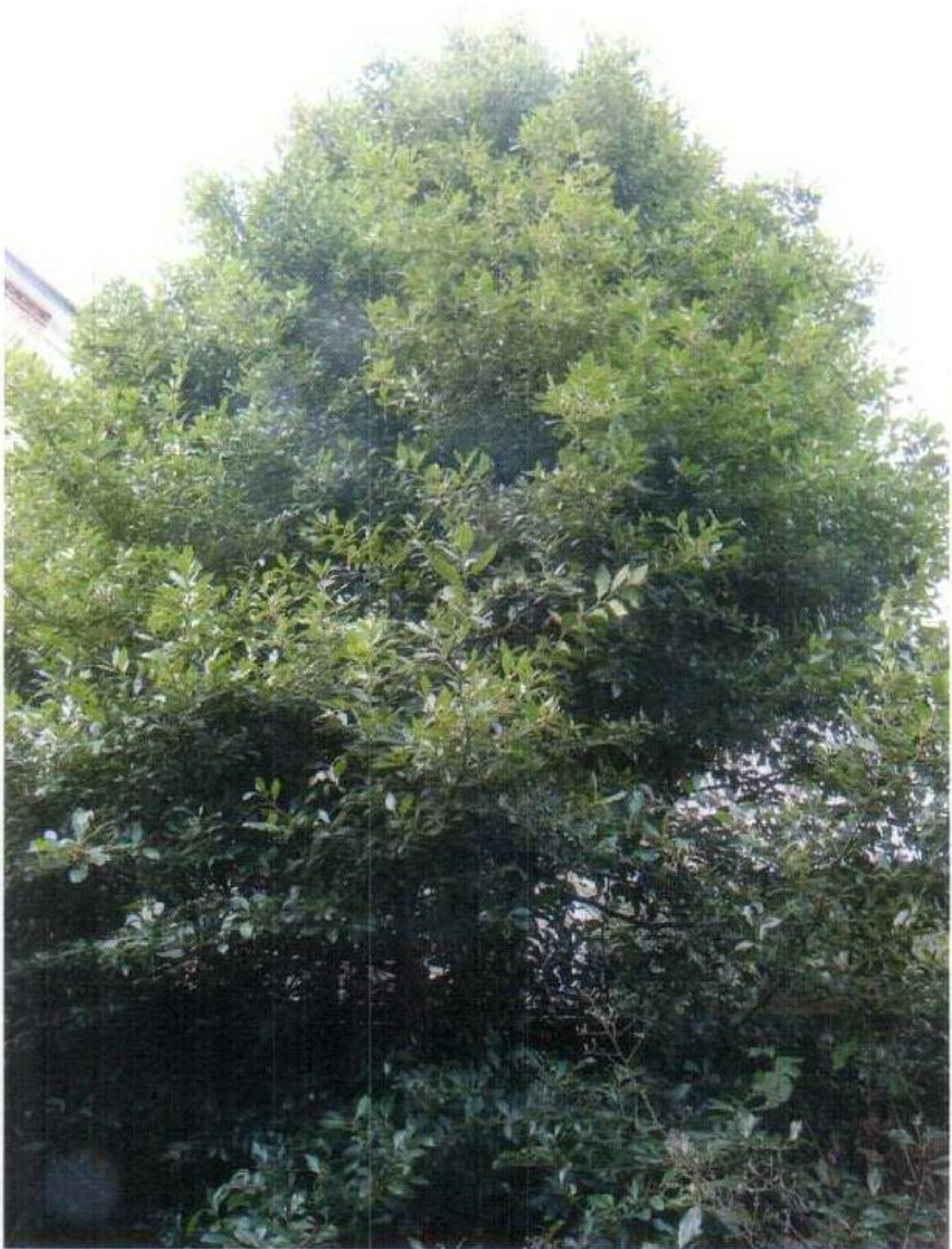
Photograph 5 – Another view of Tree 4