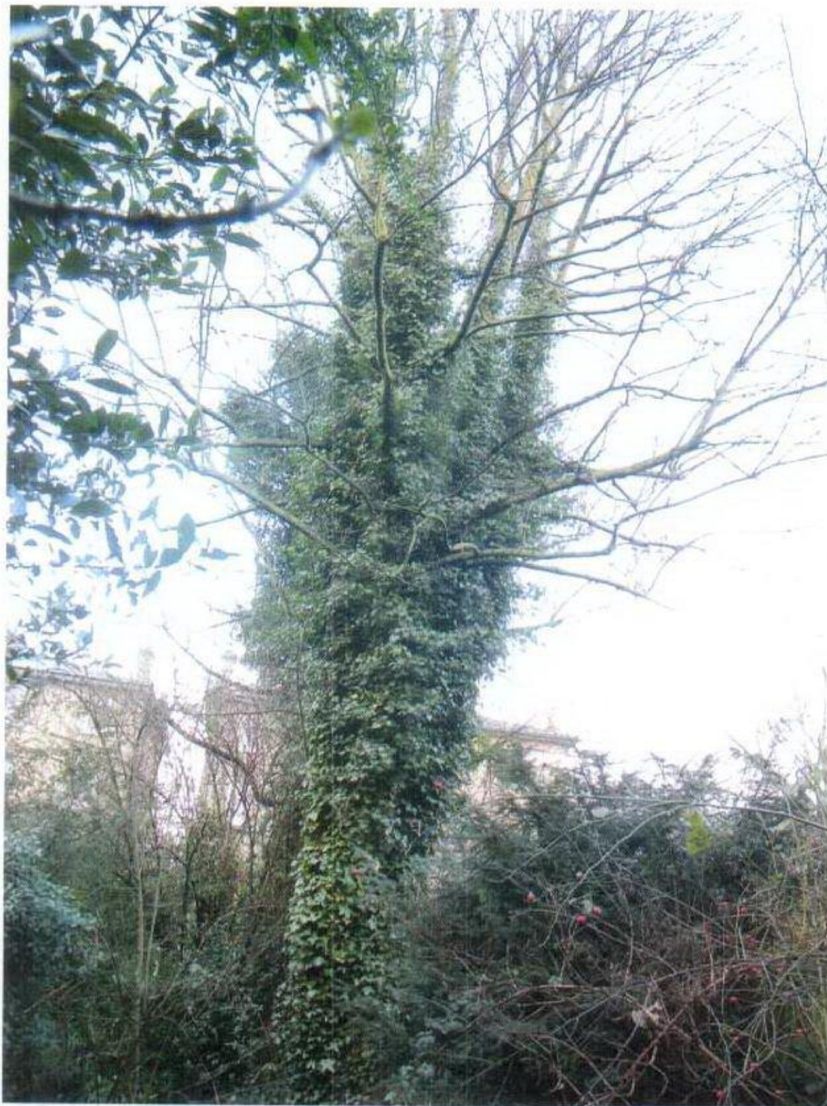
Photograph 8 – View down the right hand side of the garden showing Trees 2 & 3[T3 is right behind T2].