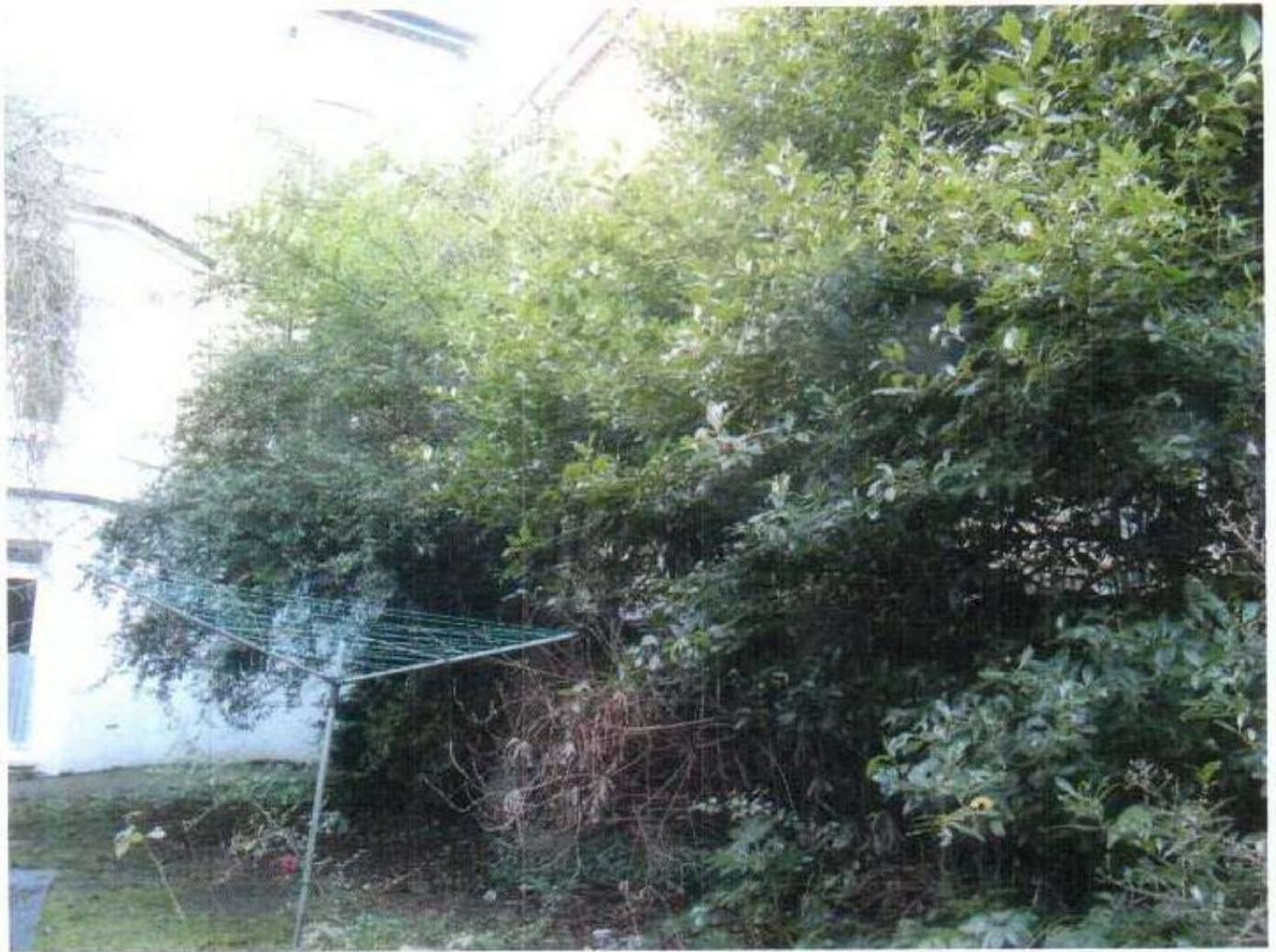
Photograph 2 - View of Tree 4 [in right foreground] and Tree 5 [in centre background] from middle of garden and also showing rear elevation of property