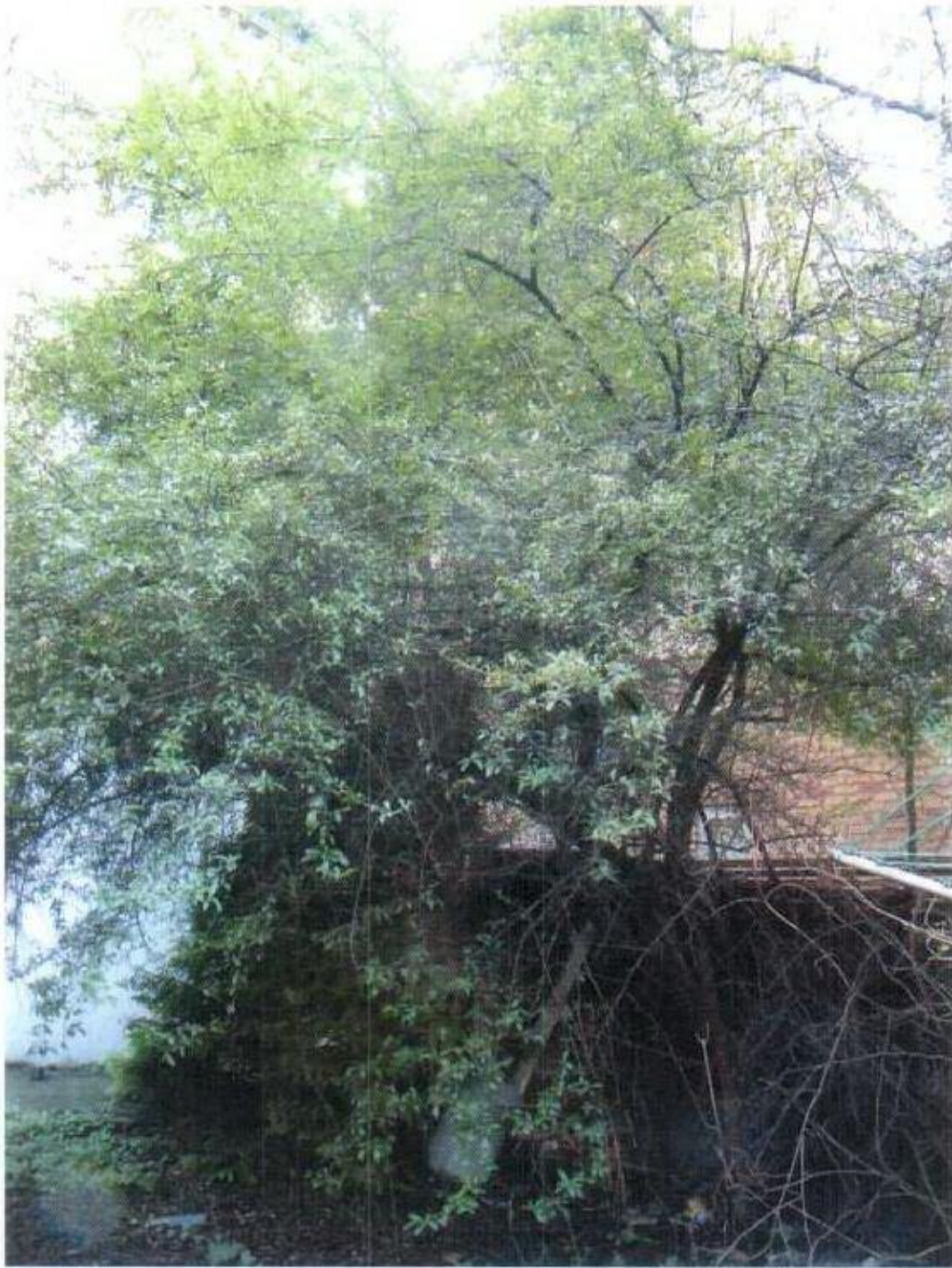
Photograph 4 – Another view of Tree 5