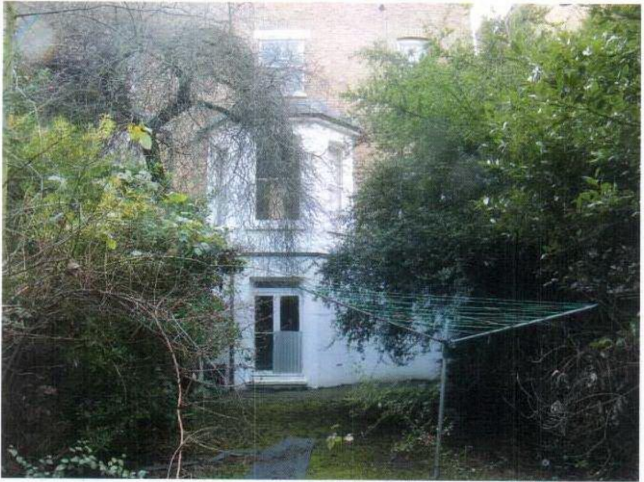
Photograph 6 – View from further down garden showing Tree 1 on left and Trees 4 & 5 on the right