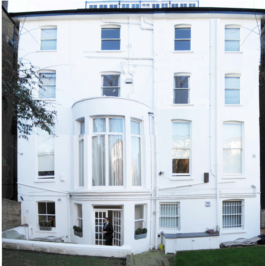
existing view of rear elevation