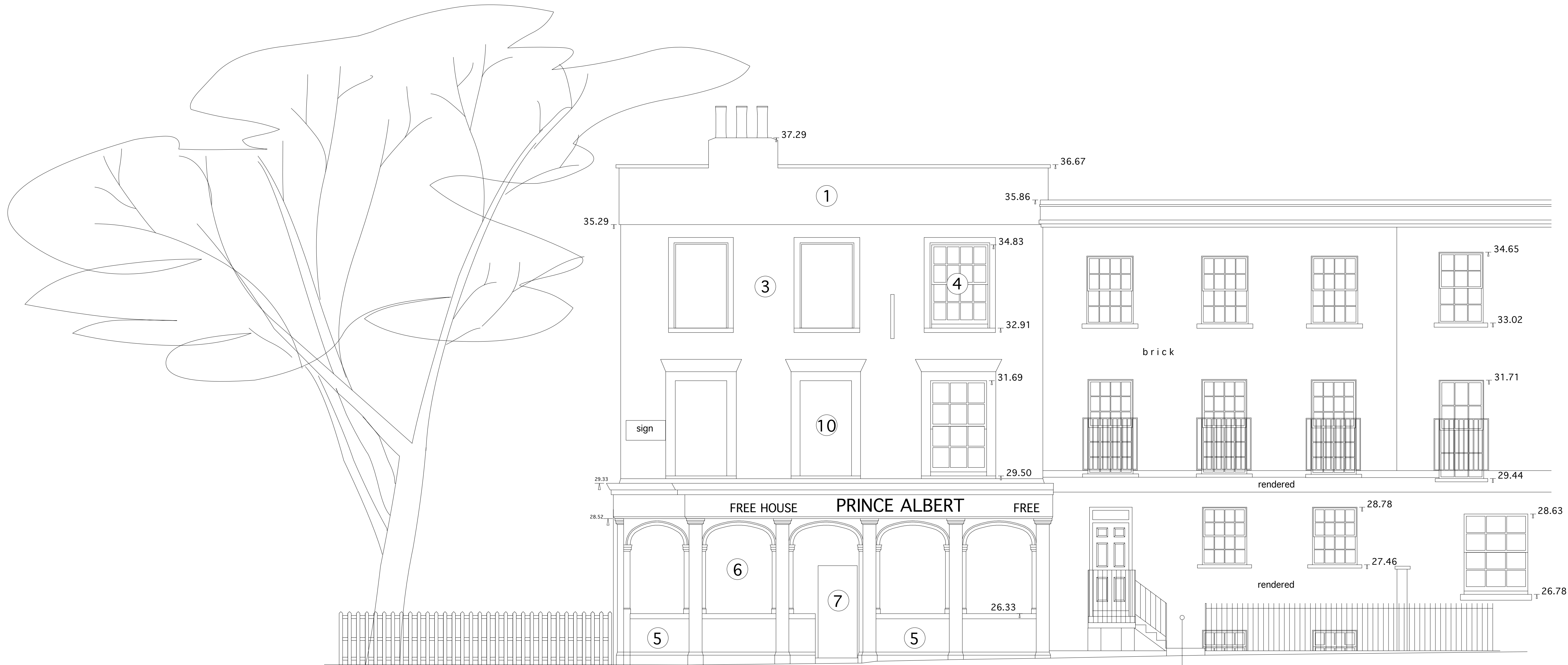
EAST ELEVATION VIEW FROM ROYAL COLLEGE STREET

163 ROYAL COLLEGE STREET 165 ROYAL COLLEGE STREET