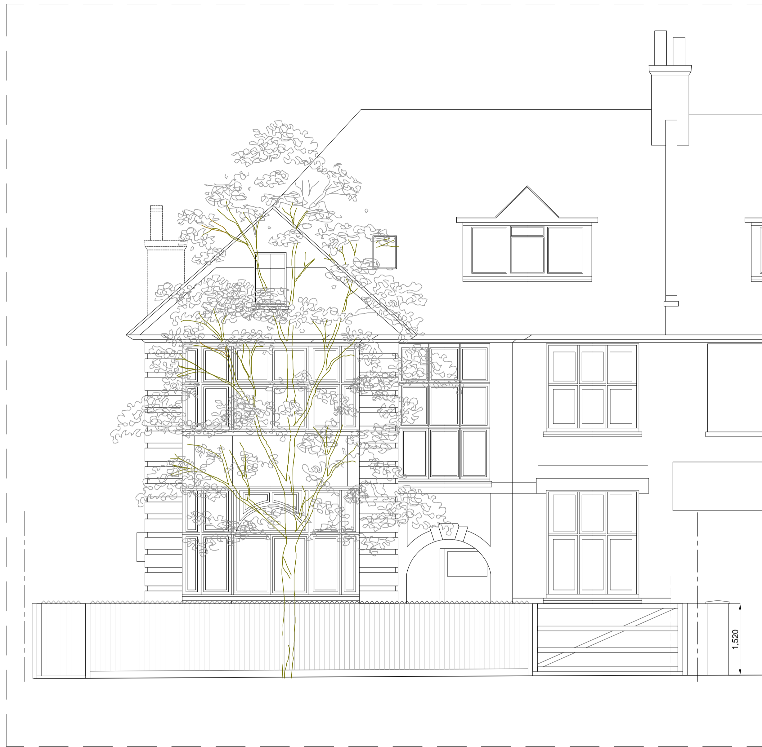
Existing Front Garden Gate Elevation 1:50

This drawing is not to be scaled. Only figured dimensions to be taken. Any discrepancies to be reported to the Studio 136 Architects prior to setting out or ordering of any materials