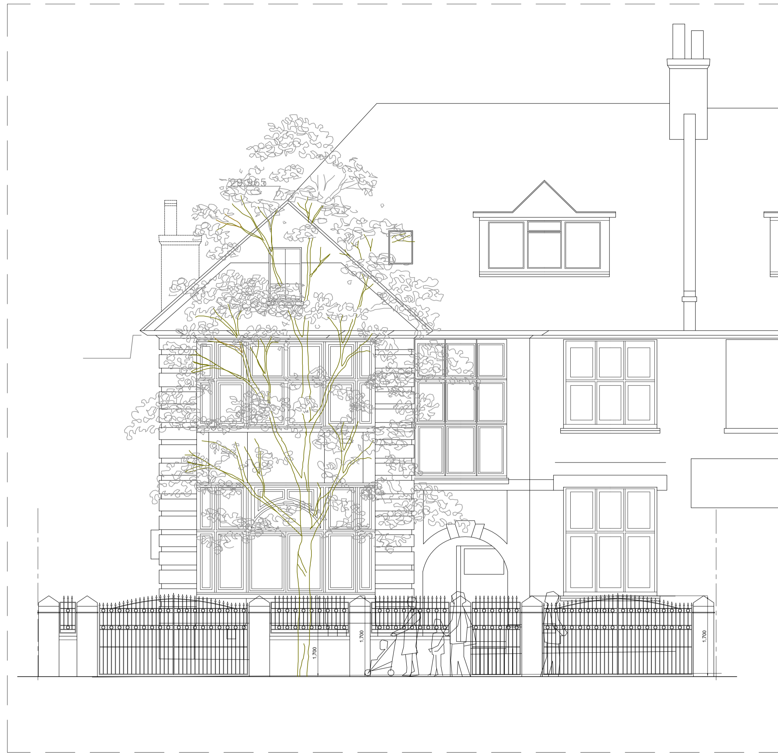
Proposed Front Garden Gate Elevation 1:50