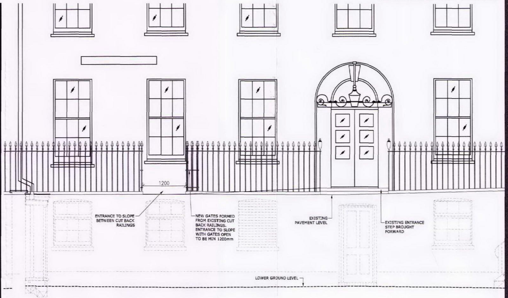
PROPOSED ELEVATION - 1:50