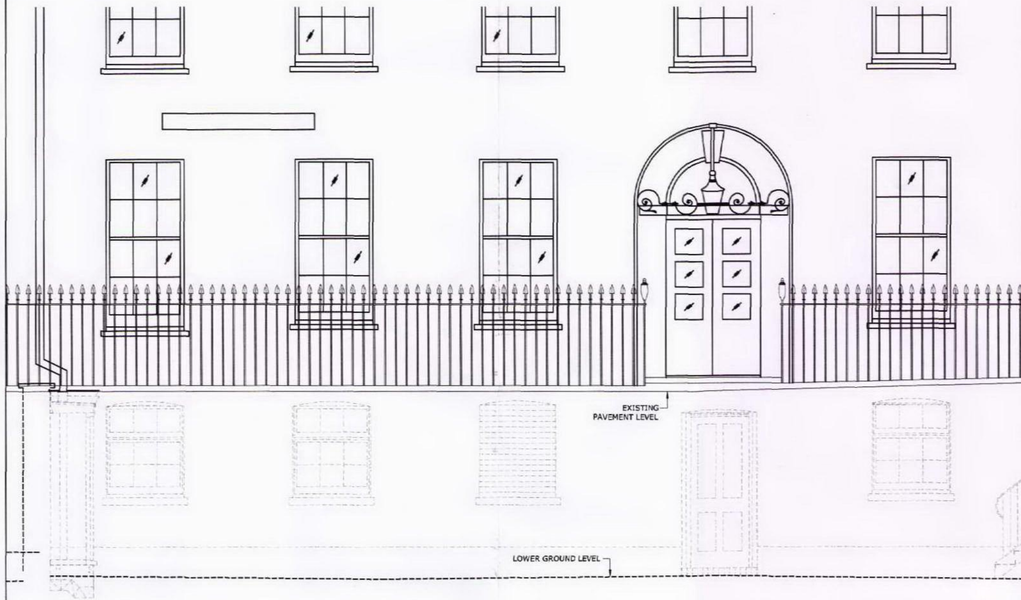
EXISTING ELEVATION - 1:50