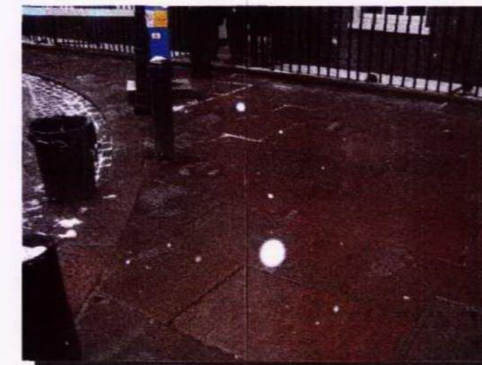
APPROACH FROM NORTH