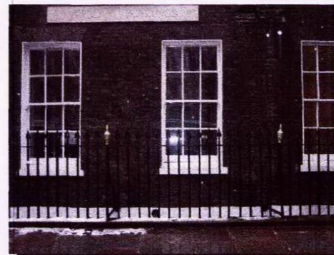
ELEVATION OF RAILINGS