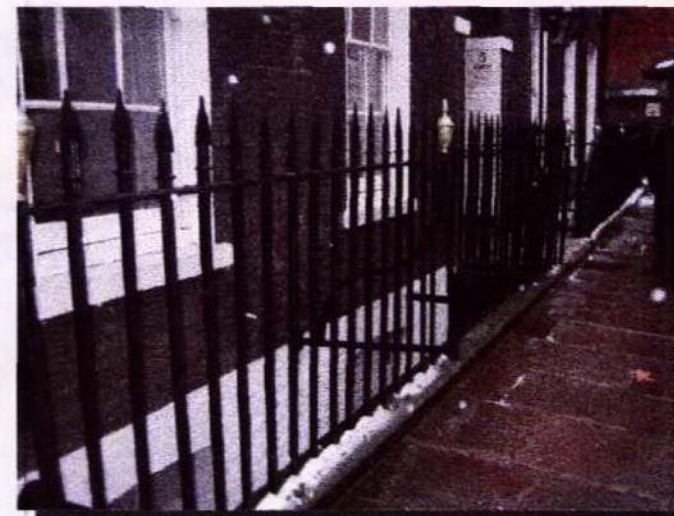
APPROACH FROM SOUTH