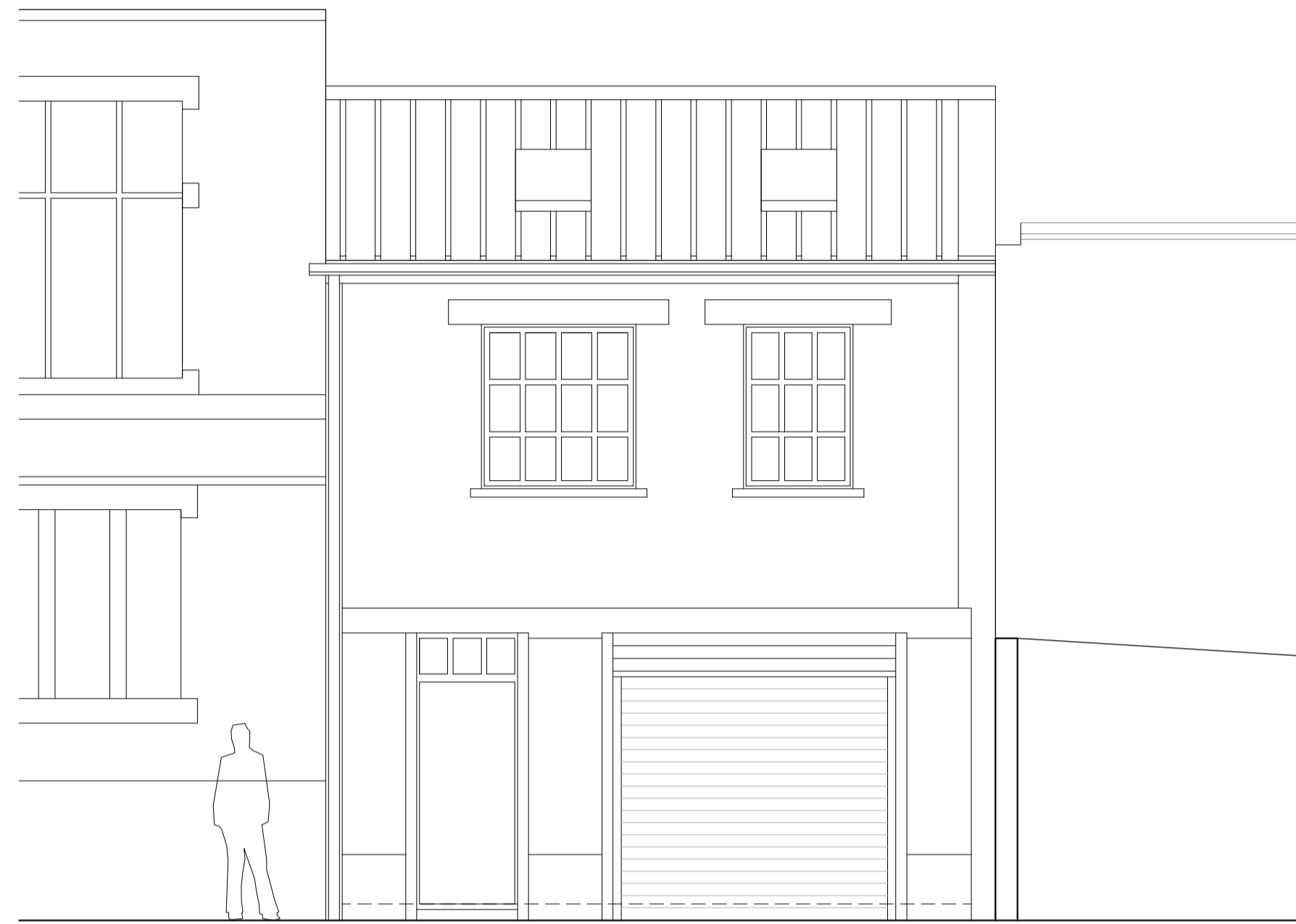
EXISTING FRONT (SOUTH) ELEVATION (BARBON CLOSE)