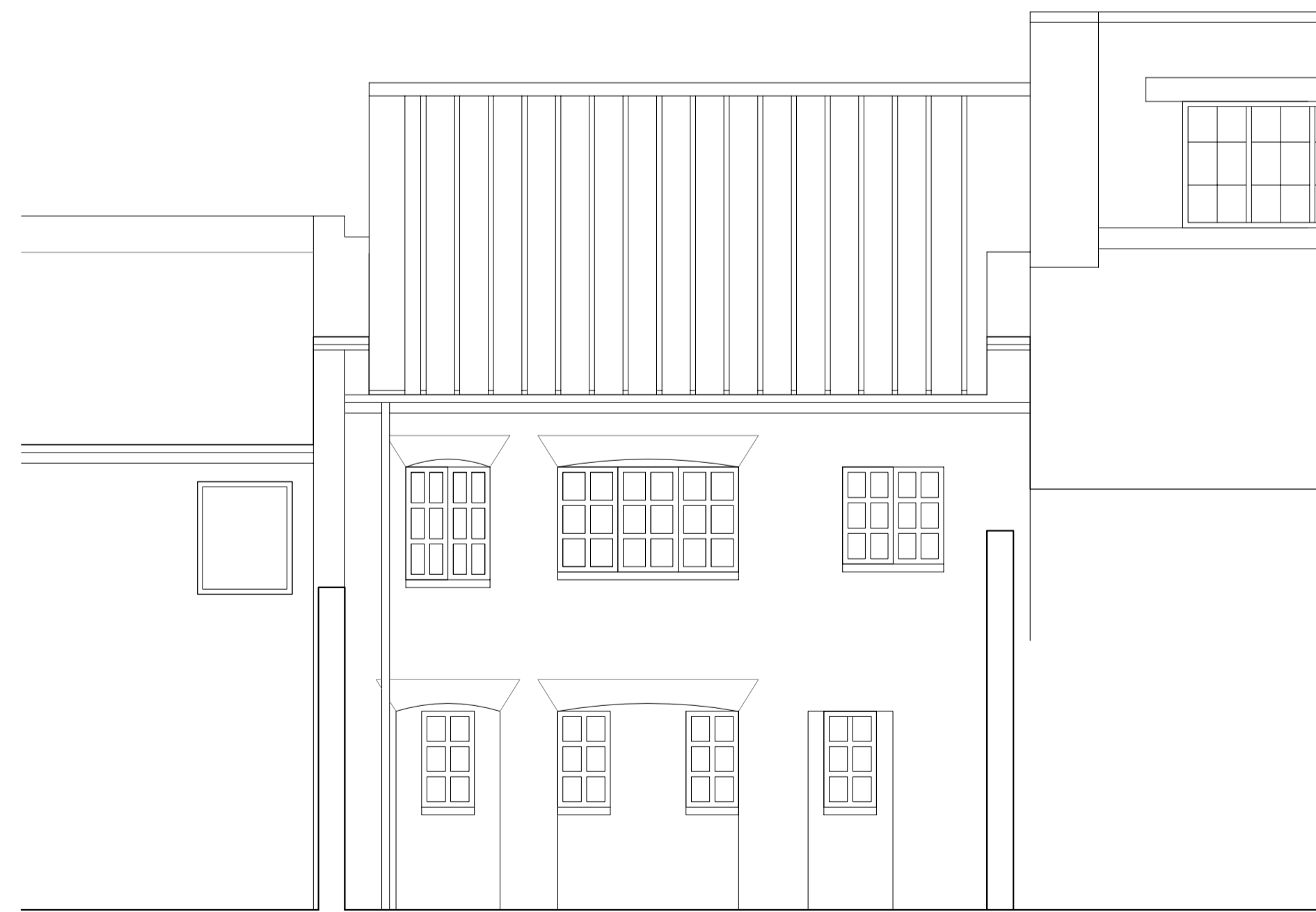
EXISTING REAR (NORTH) ELEVATION

Section through building on Great Ormond St