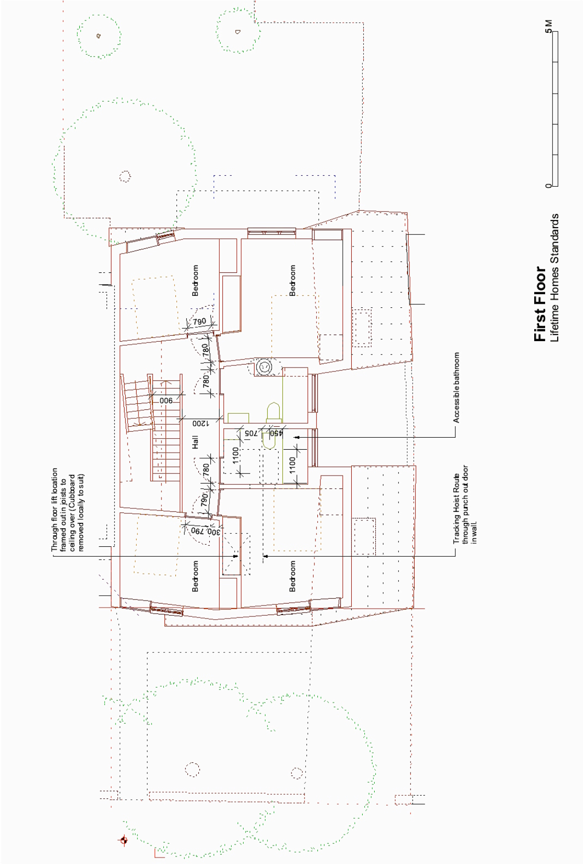
First Floor Lifetime Homes Standards