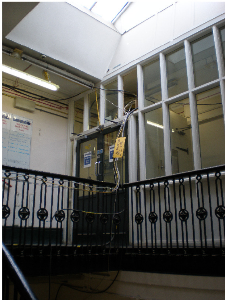
Second Floor - East screen and door