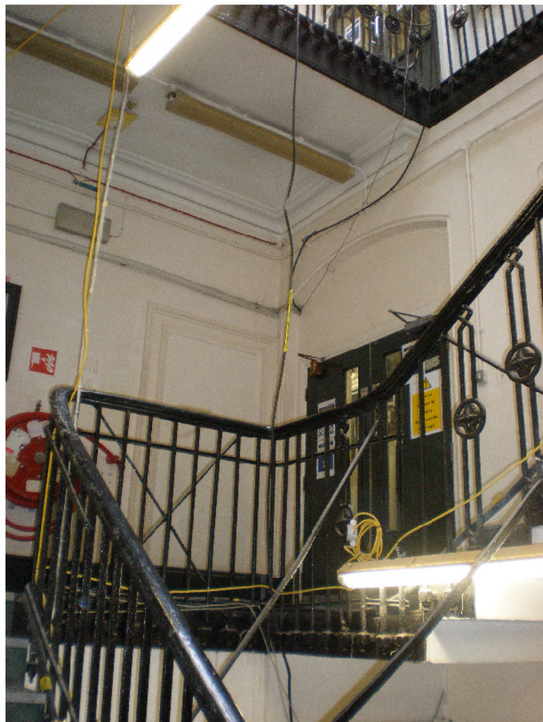
First Floor - East door