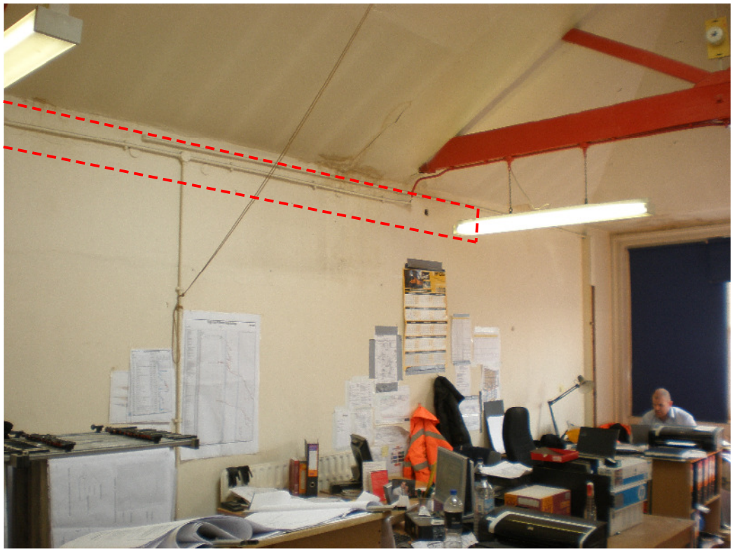
Second Floor - Room 2/ 49 South West Corner