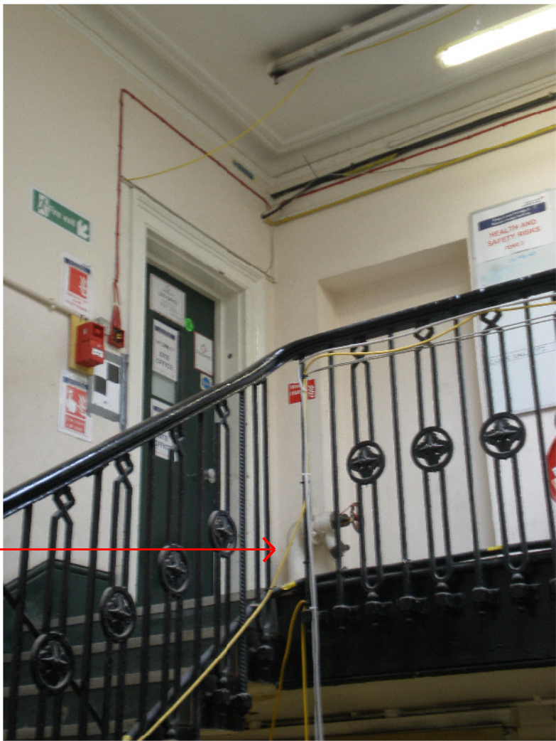
Second Floor - Stair West door