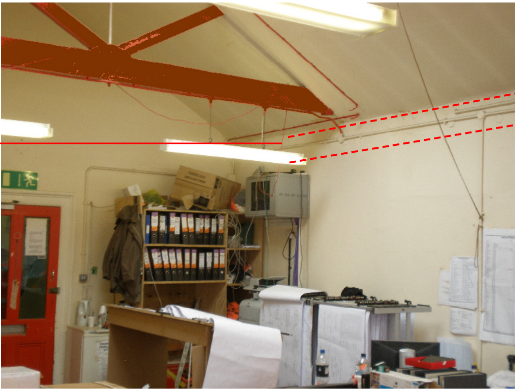
Second Floor - Room 2/ 49 South East Corner