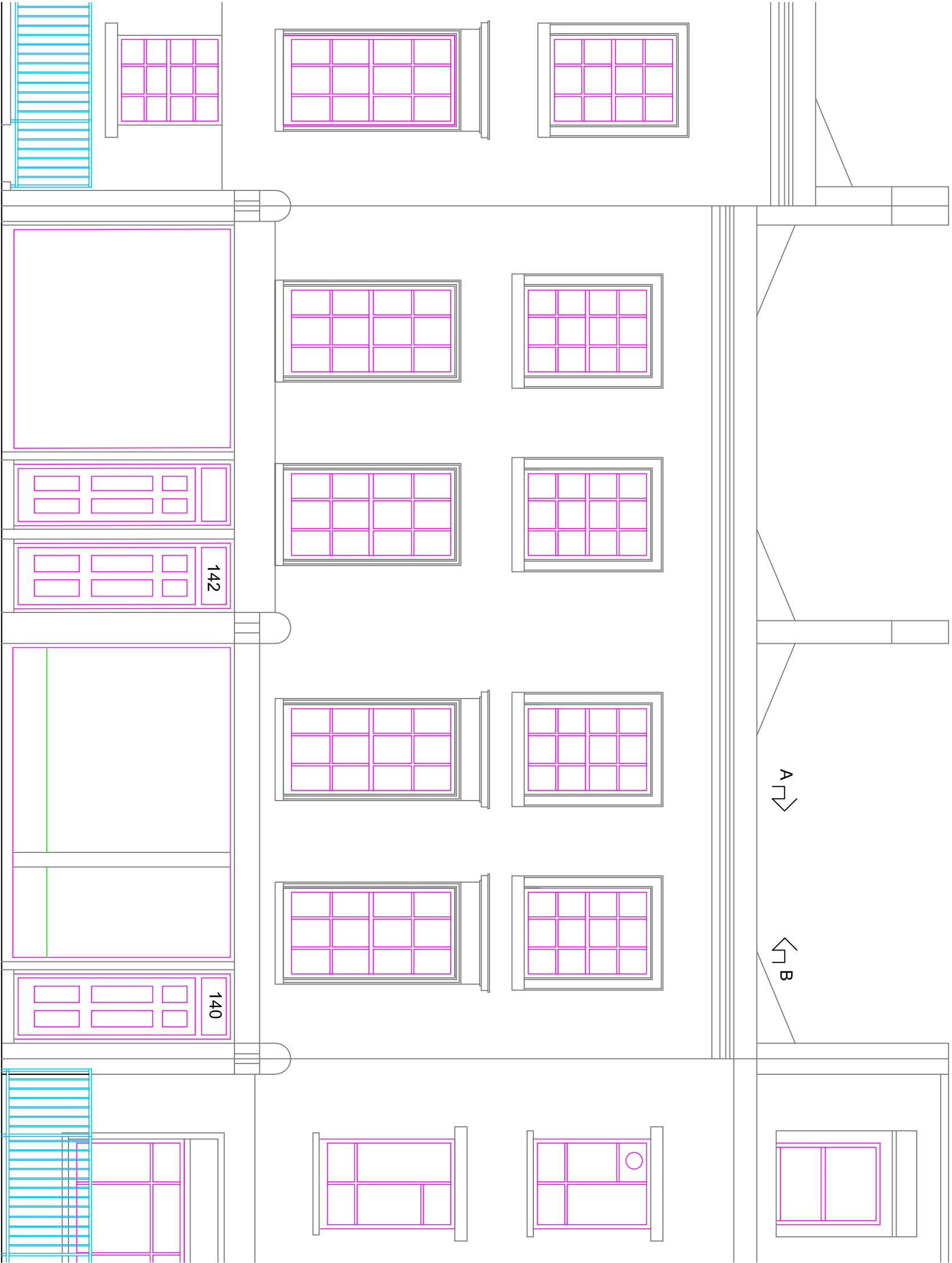
EXISTING FRONT FACADE