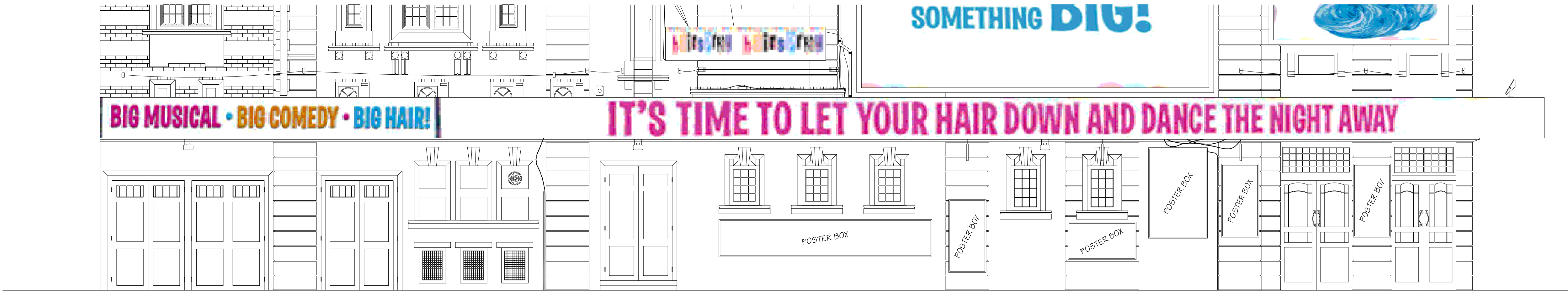
EXISTING PART ELEVATION ON BLOOMSBURY STREET CANOPY (SCALE 1:50 AT A1)