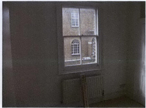
6. Second Floor