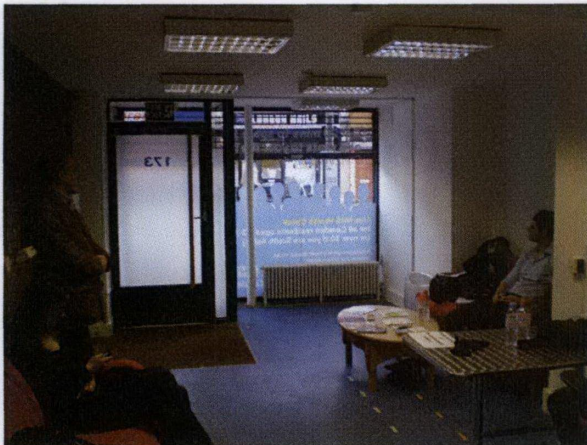
3. Ground Floor (front area)