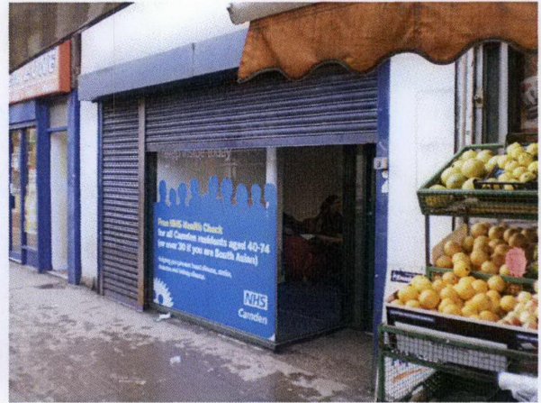
2. Close-up of Front elevation