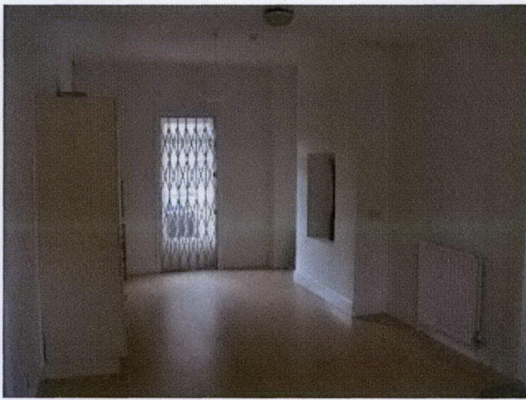
5. First Floor