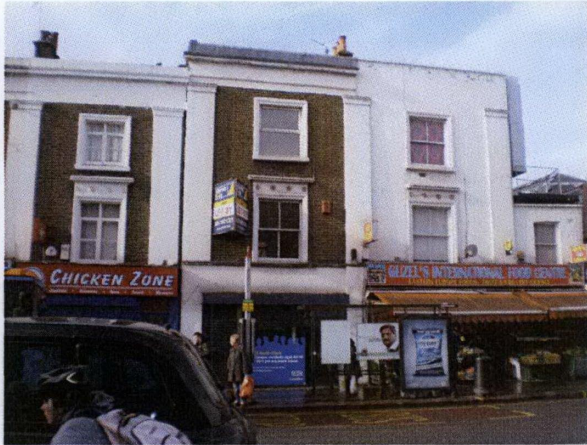
1. Front elevation