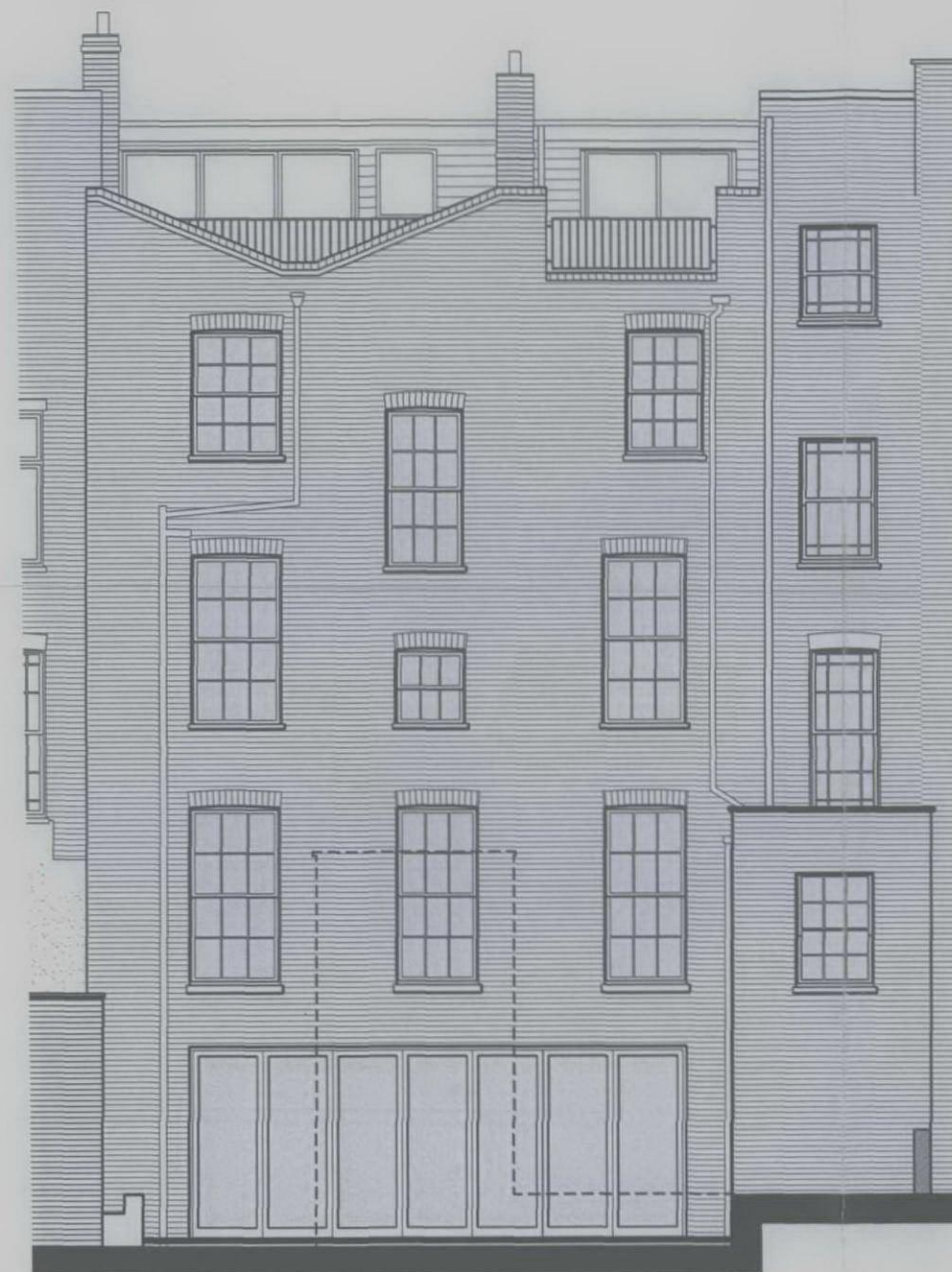
PROPOSED ELEVATIONS REAR ELEVATION