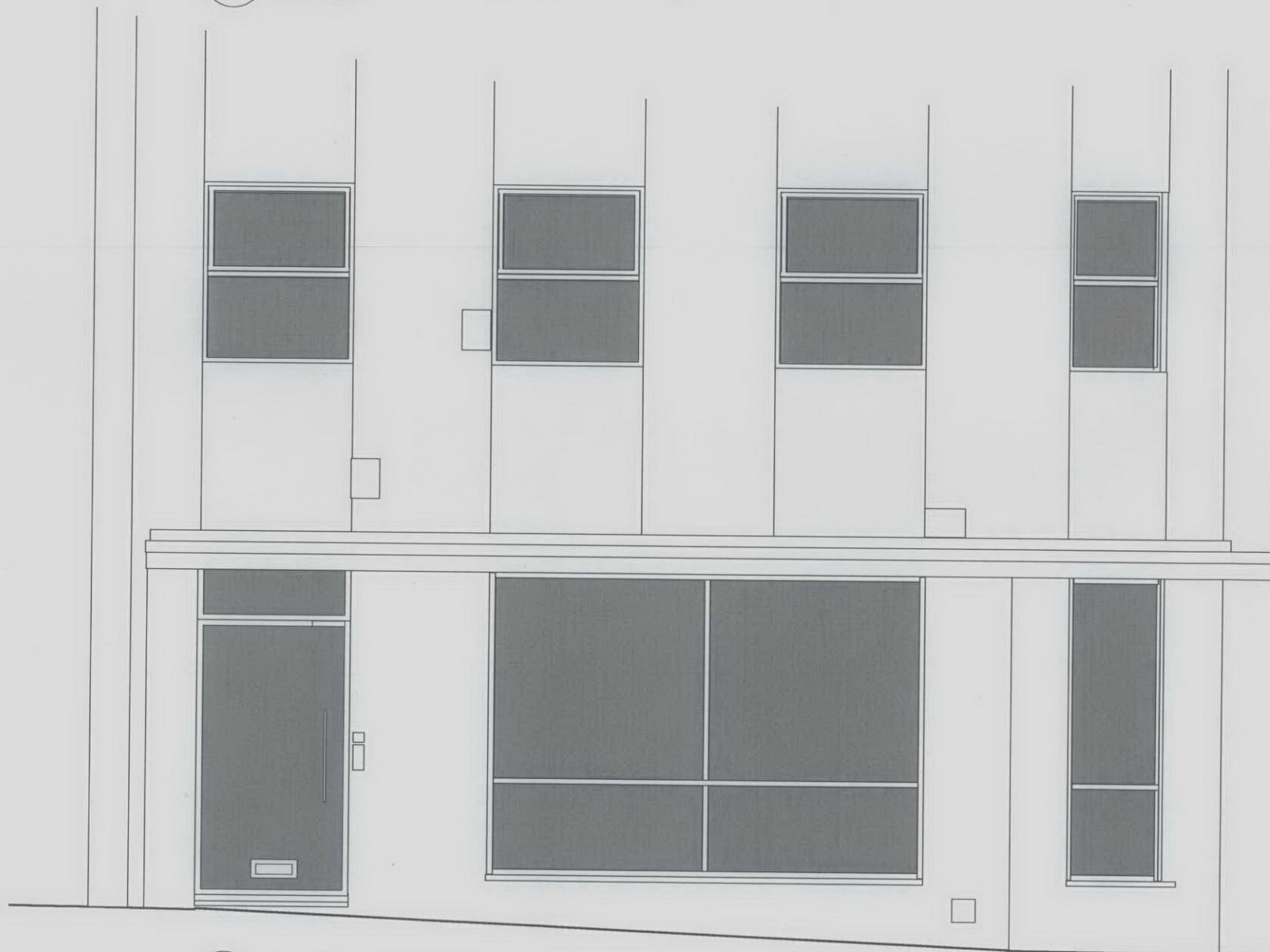
Front Elevation - Existing Scale 1:50