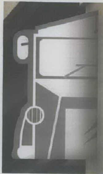
Sketch for information