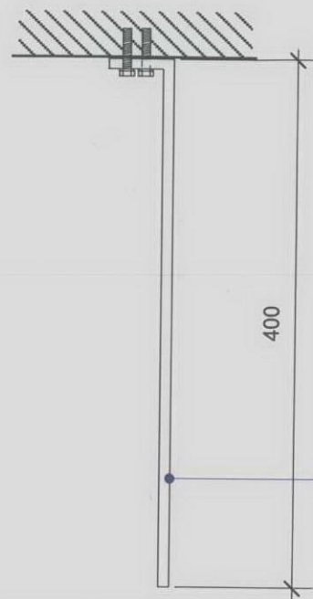
Plan Section Scale 1:5