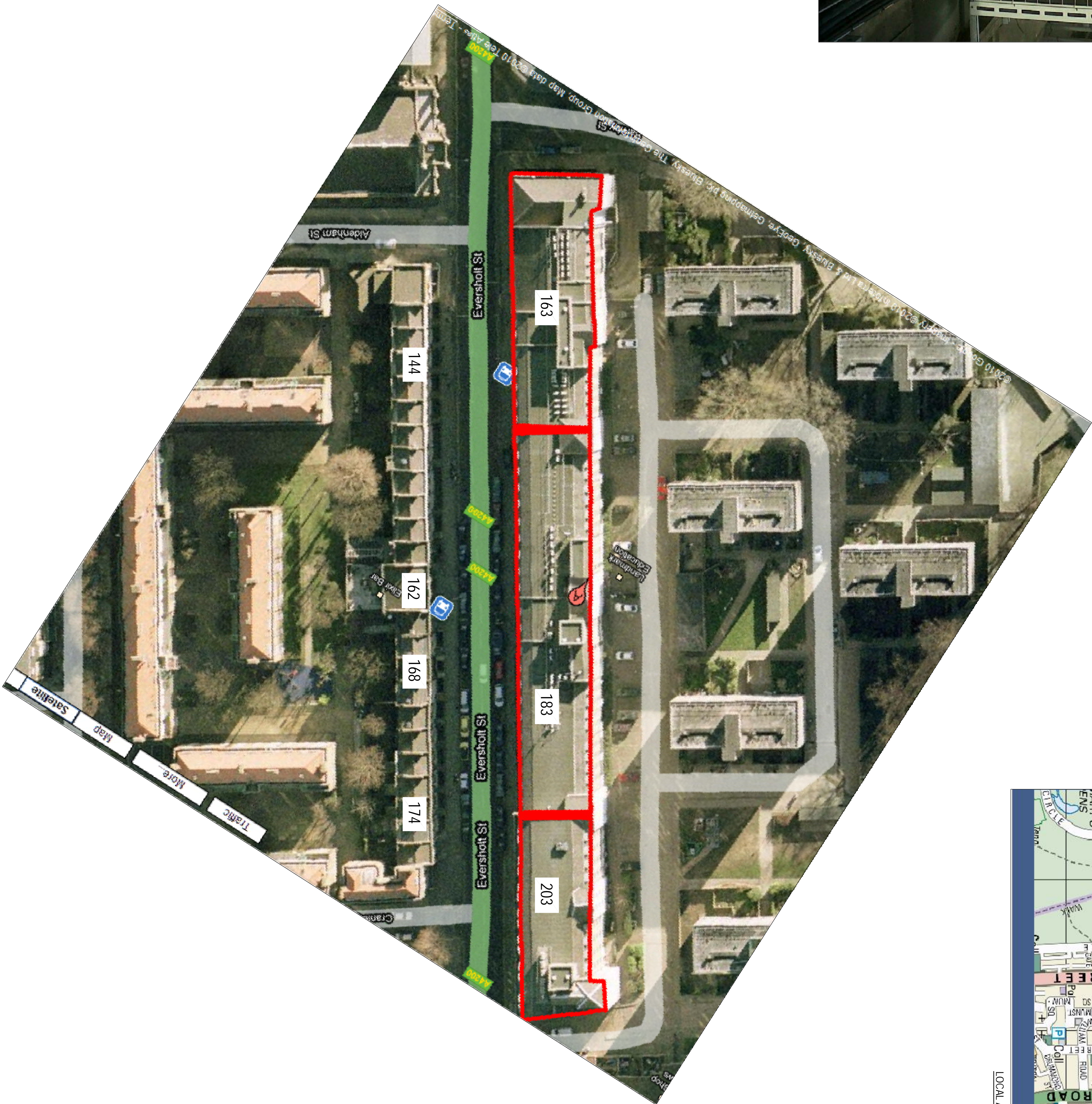
VIEW OF 163, 203 EVERSOLT STREET WITH SURROUNDING BUILDINGS