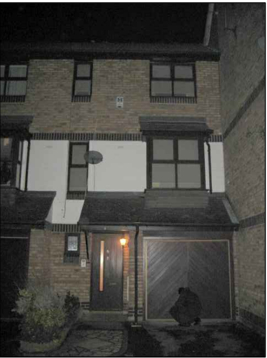
PHOTO OF EXISTING FRONT FACADE

NOTES: CORVIN CONSTRUCTION. RETAIN COPYRIGHT OF DESIGN, SCHEME & OWNERSHIP OF DRAWINGS. DRAWING SHOULD BE READ IN CONJUNCTION WITH STRUCTURAL ENG.'S DRAWINGS. ANY OMISSION TO BE REPORTED TO AND CLARIFIED WITH CLIENT PRIOR TO COMMENCEMENT. VERIFY DIMENSIONS, LEVELS AND EXISTING STRUCTURE, ETC ON SITE PRIOR TO COMMENCEMENT. ALL WORKS TO COMPLY WITH CURRENT REGULATIONS, BRITISH STANDARDS ETC. PLEASE NOTE THAT BEFORE BUILDING WORKS COMMENCES IT IS THE RESPONSIBILITY OF THE BUILDER OR OWNER TO SERVE PARTY WALL NOTICES TO ALL NEIGHBORS. INITIAL DRAWINGS SUBMITTED TO BUILDING CONTROL ARE SUBJECT TO ADDITIONAL INFORMATION REQUIRED BY BUILDING CONTROL /NHBC, WHICH COULD HAVE SIGNIFICANT COST/ OR ADDITIONAL WORKS TO BE DONE ON SITE. ALL WORKS COMMENCED ON SITE PRIOR TO OBTAINING FULL BUILDING CONTROL APPROVAL WILL BE CARRIED OUT AT YOUR OWN RISK.