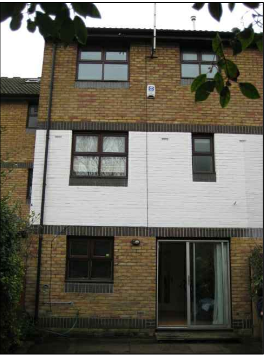
PHOTO OF EXISTING REAR FACADE