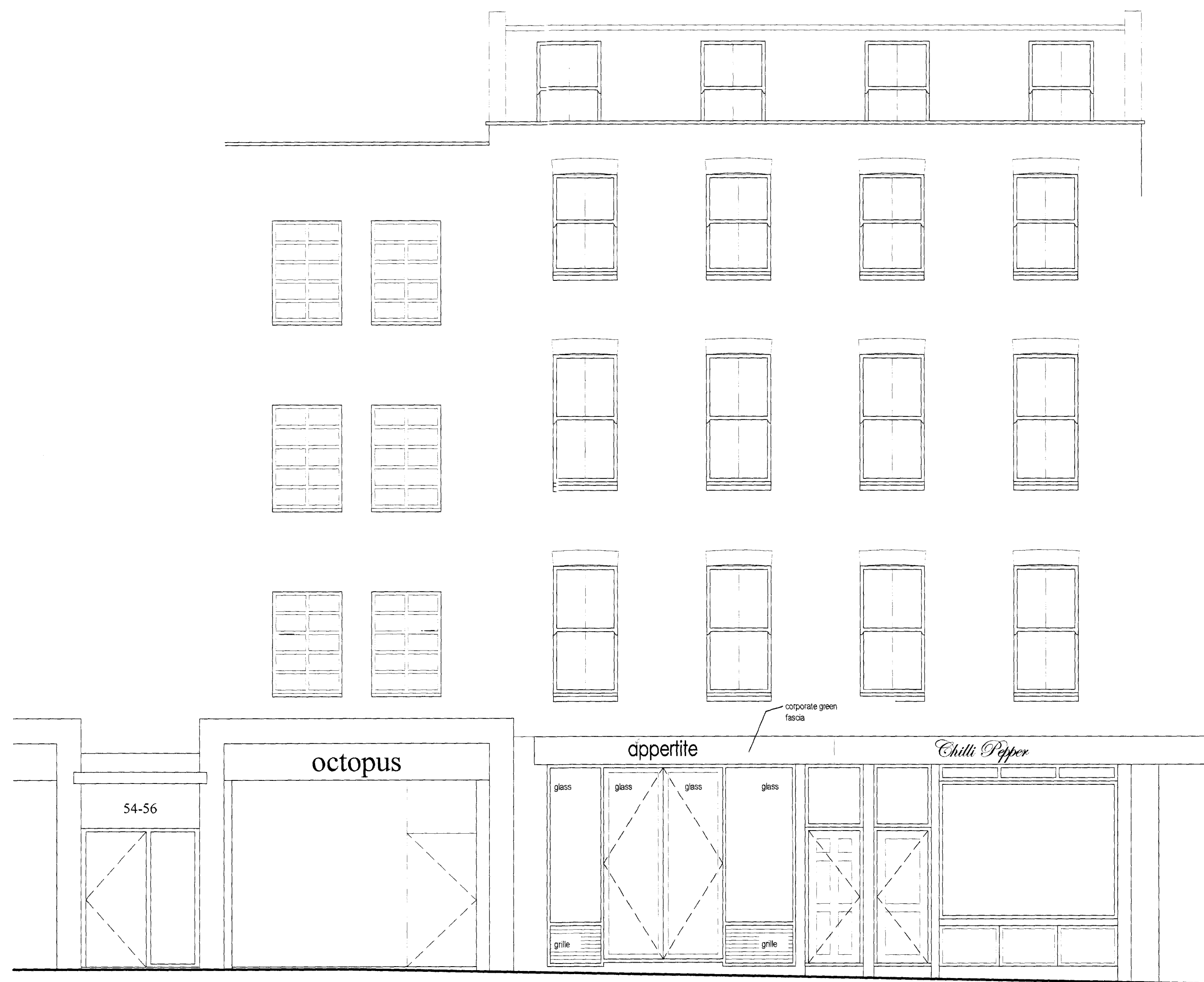
proposed front elevation