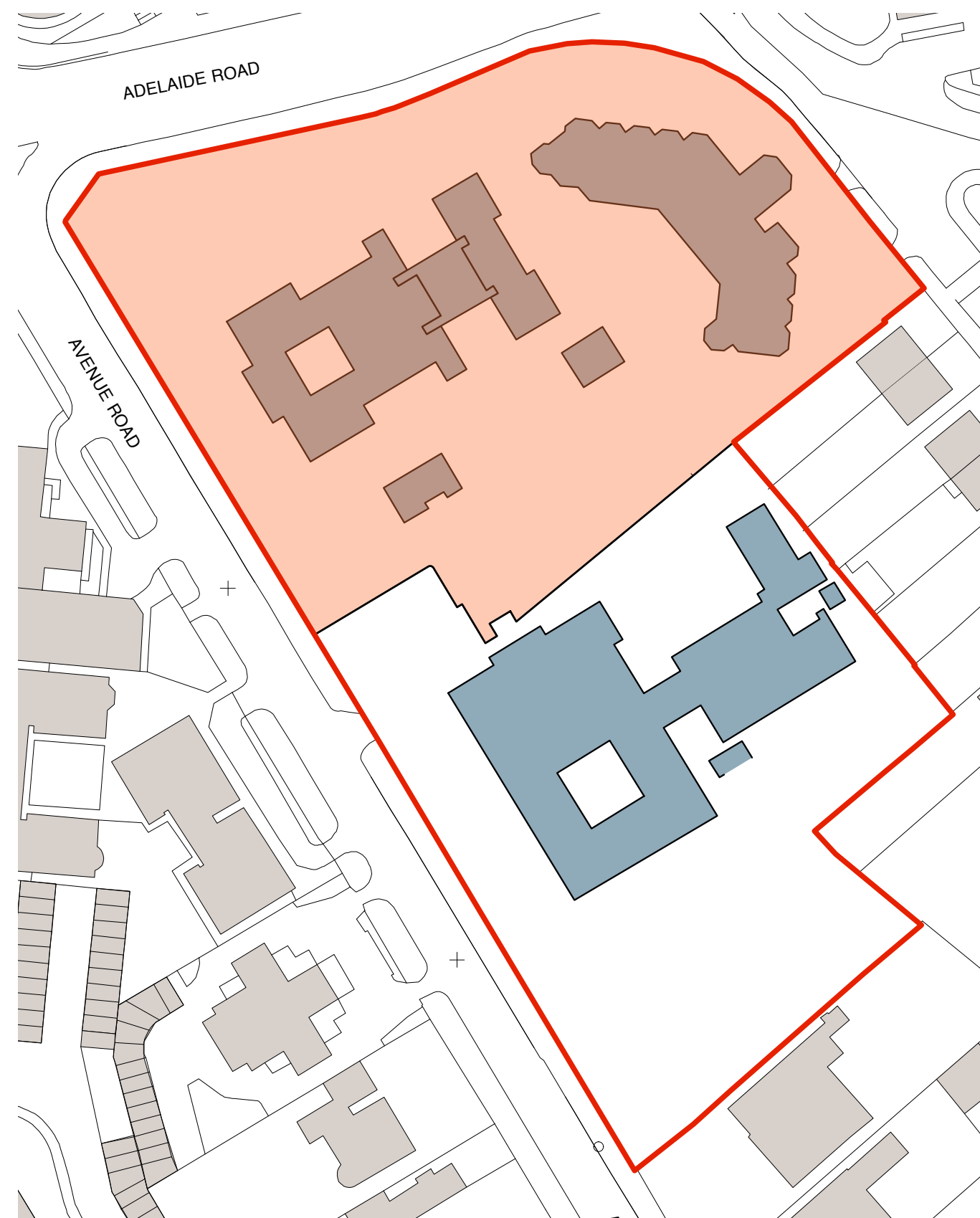
01 Demolition Substructure & Superstructure works Demolition of existing buildings, piling, geothermal piles, substructure and superstructure works excluding envelope