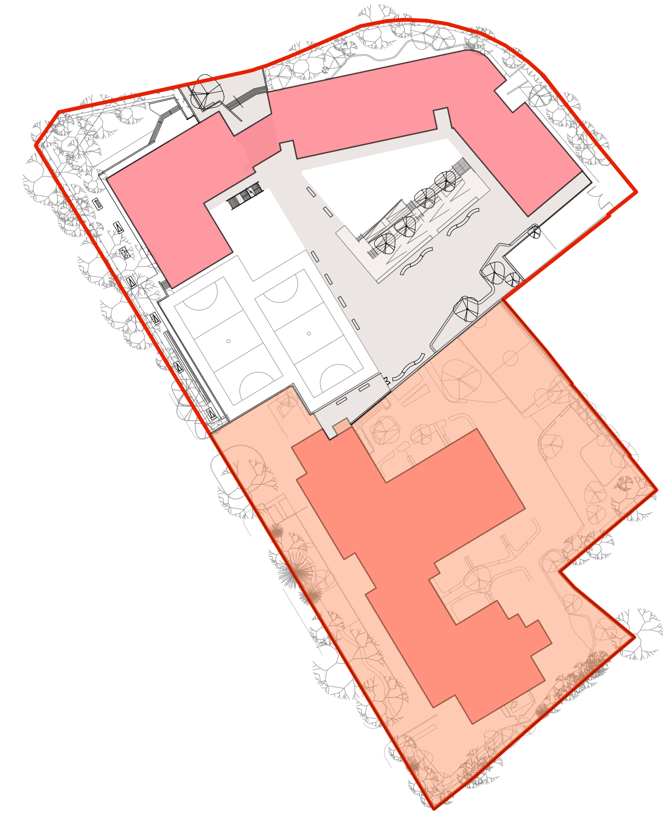
04 Complete SCSSS build Completion of SCSSS works including external works