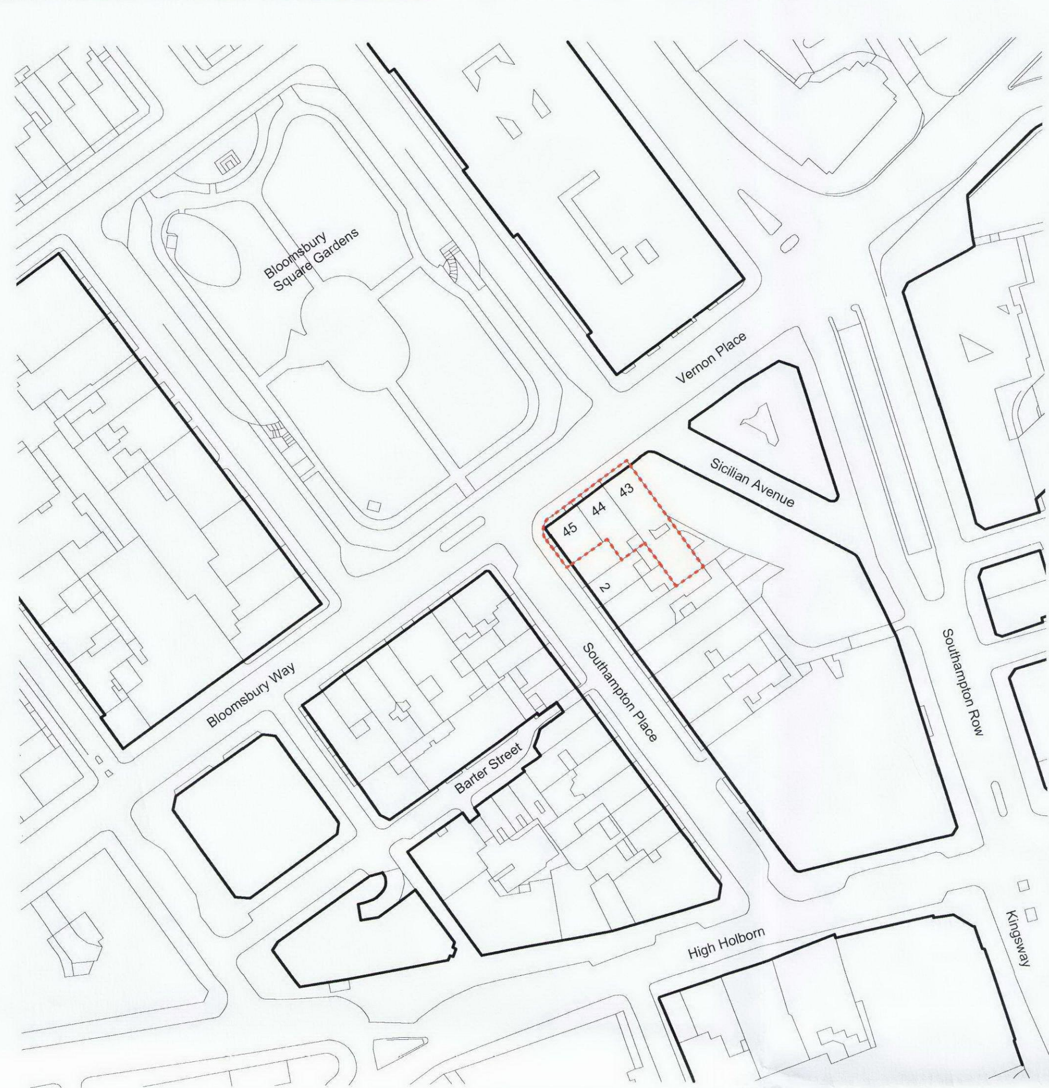
01 LOCATION PLAN A0080 EXISTING 1:1000