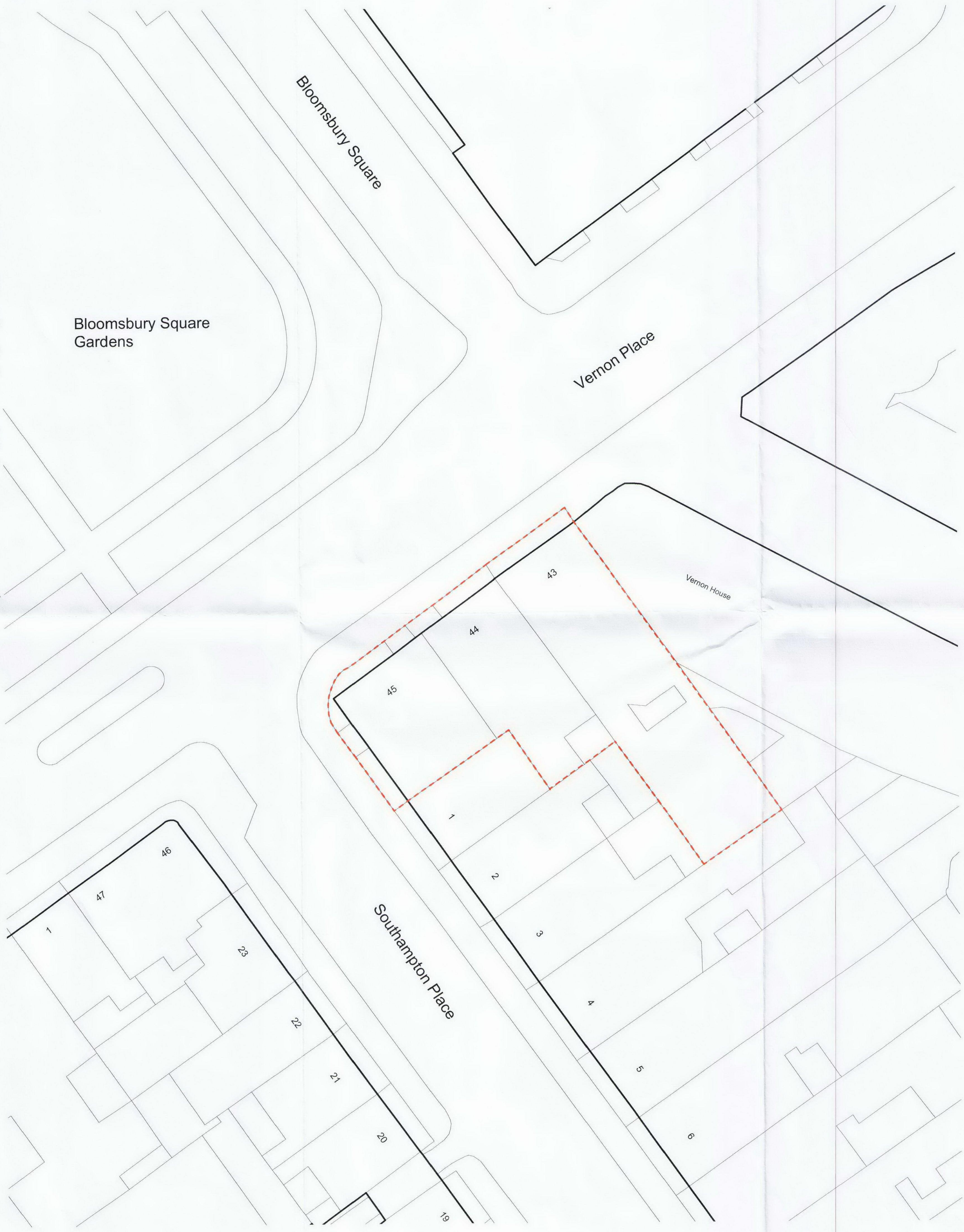
02 SITE PLAN A0080 EXISTING 1:200