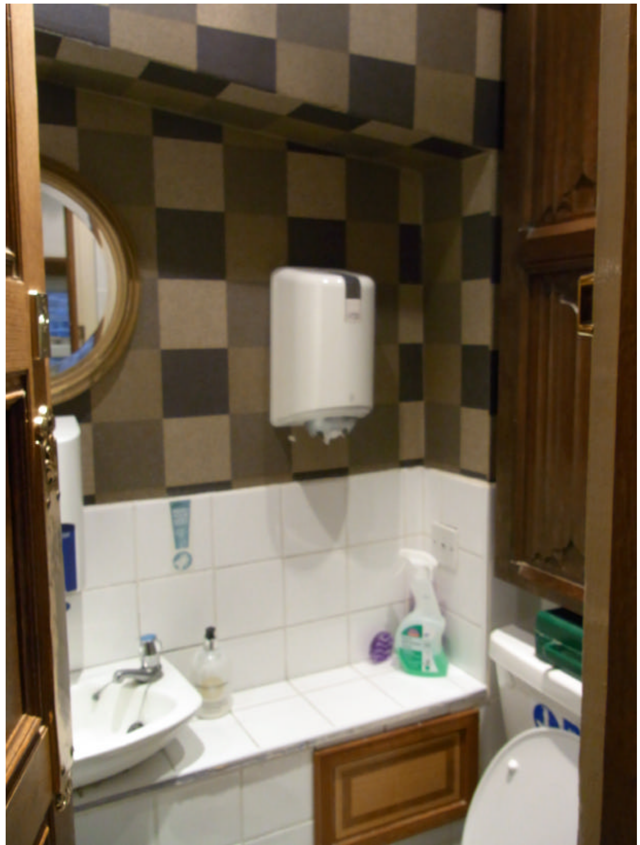
7. Existing WC. Partition on the right and bulkhead to be removed to form ensuite shower room.