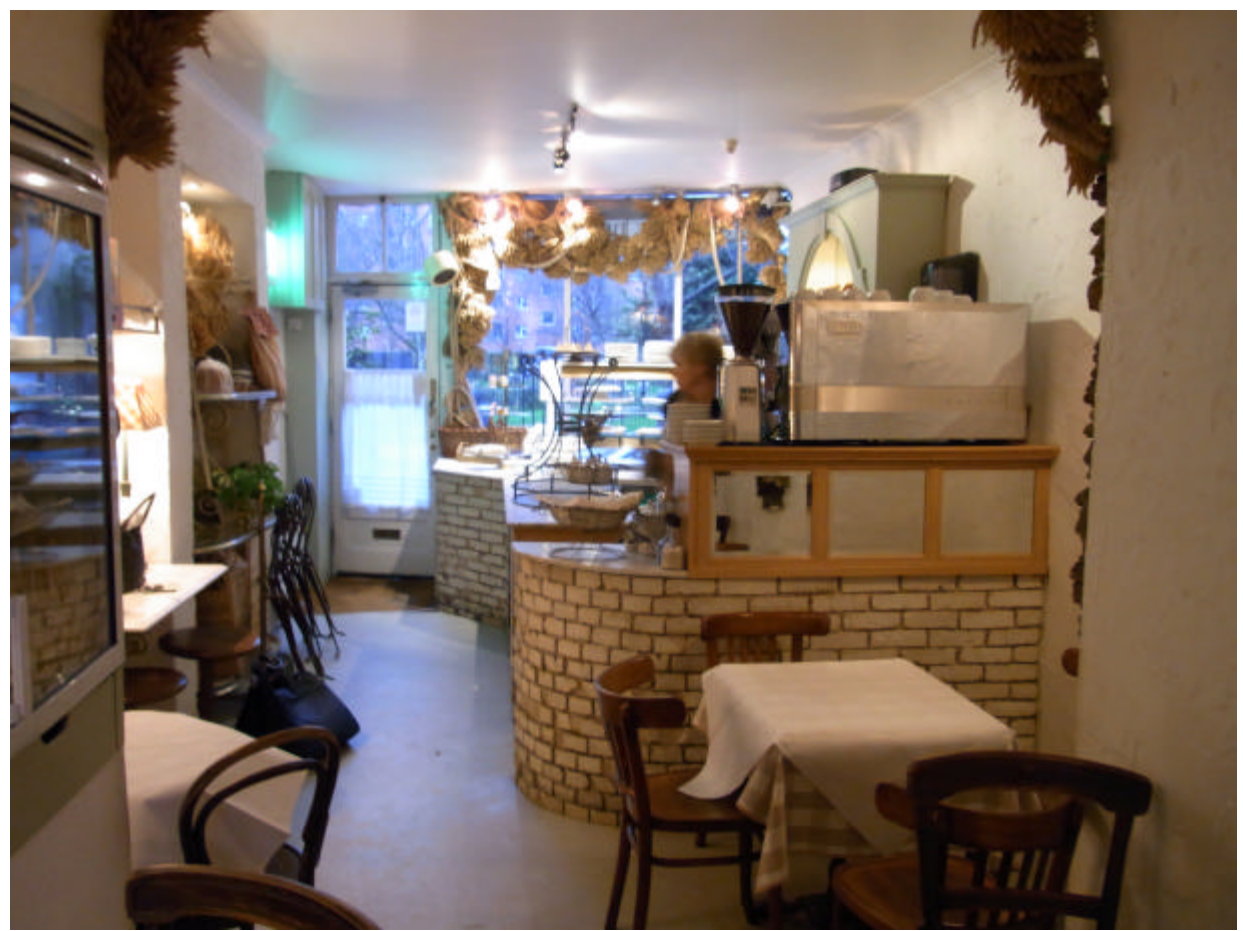
1. 63 Judd Street in its current use as a coffee shop.