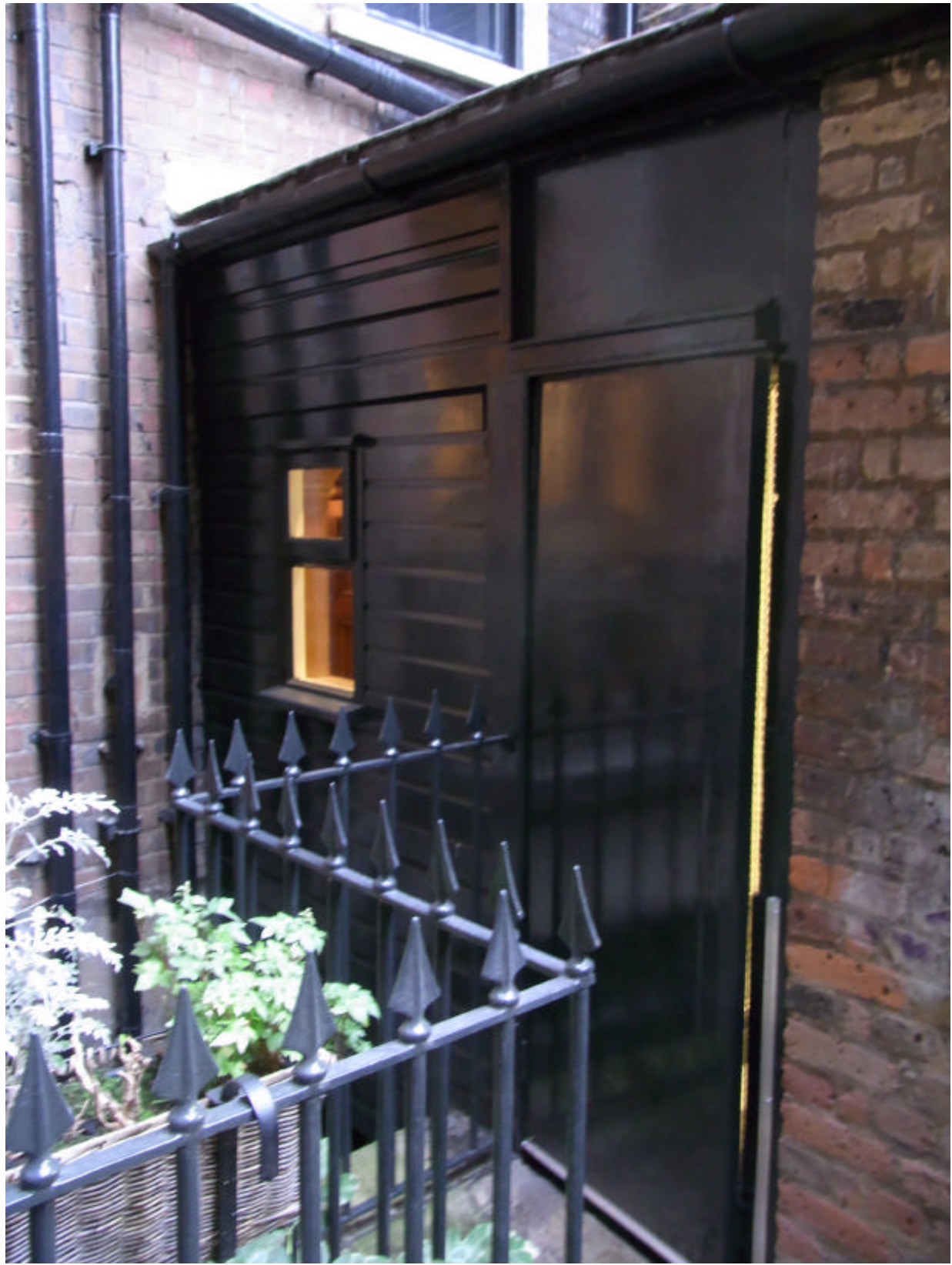
8. Non-original rear extension to be extended.