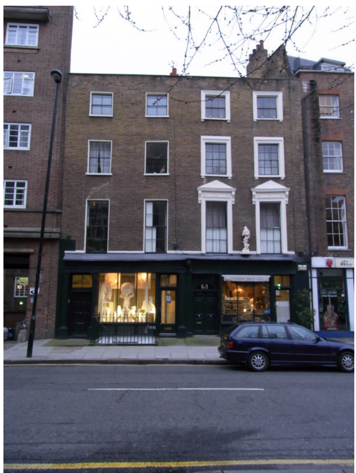
3. View from Judd Street of no.63 on the right and no.61 on the left.