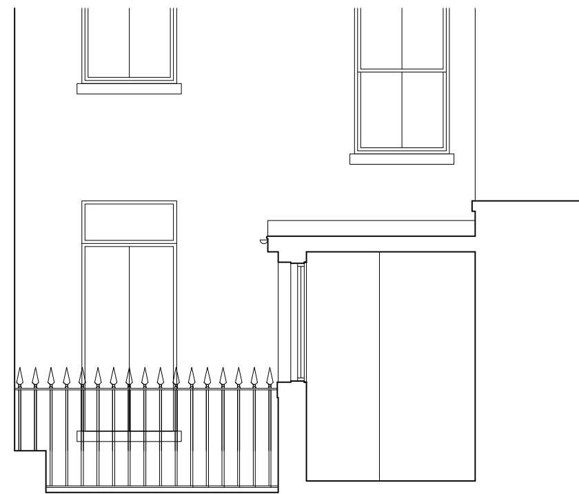
BB Existing Section BB 001 1:50@A3