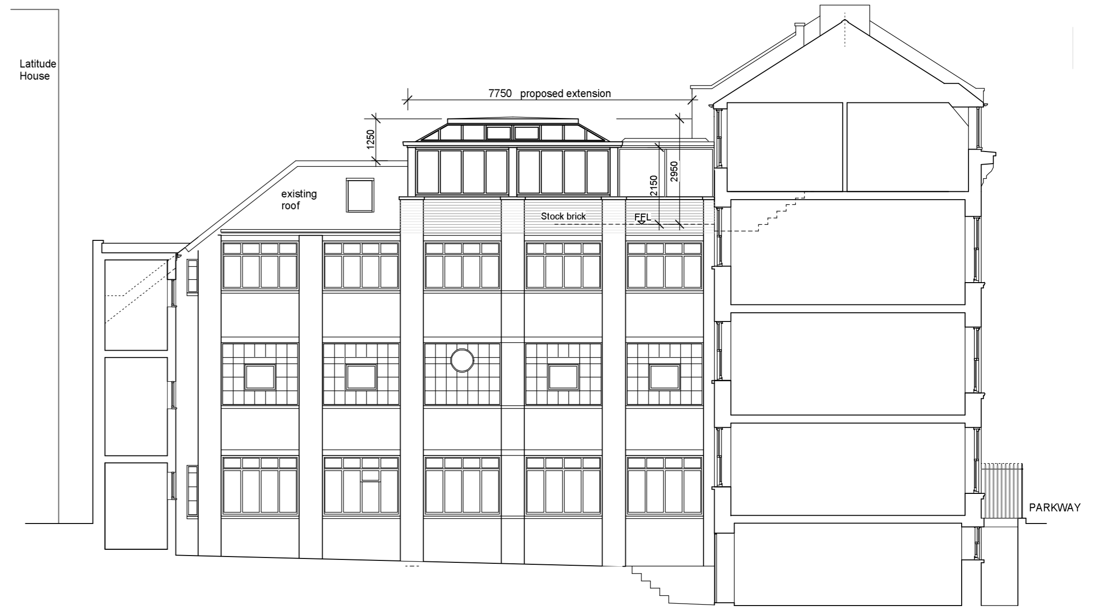
ELEVATION - SECTION 1-1