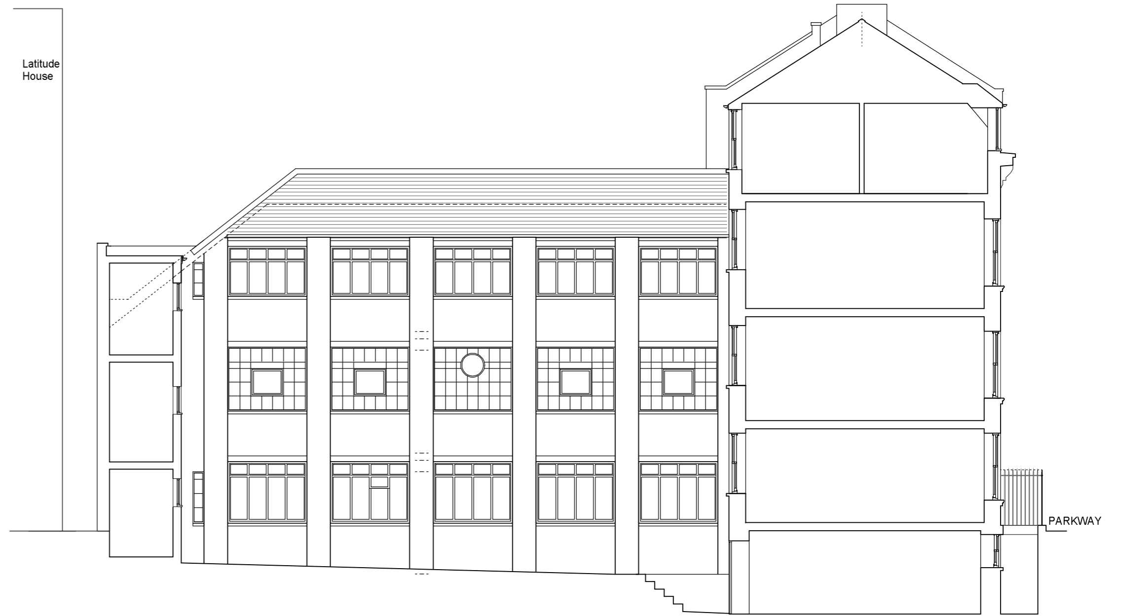
ELEVATION - SECTION 1-1