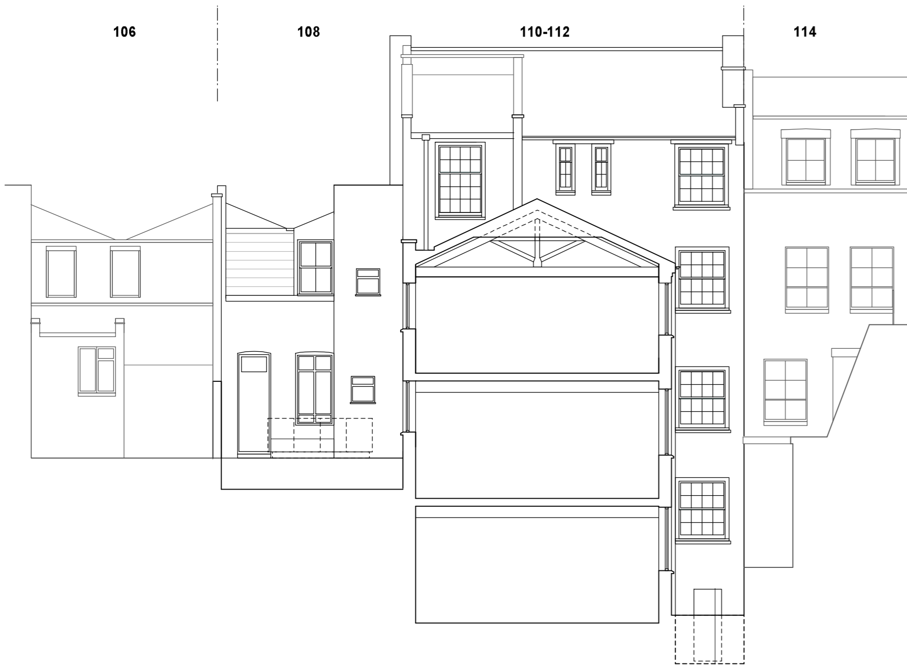
ELEVATION - SECTION 2-2