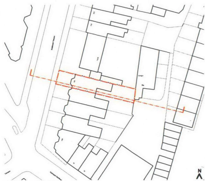
site location (1:1000 @ A3)